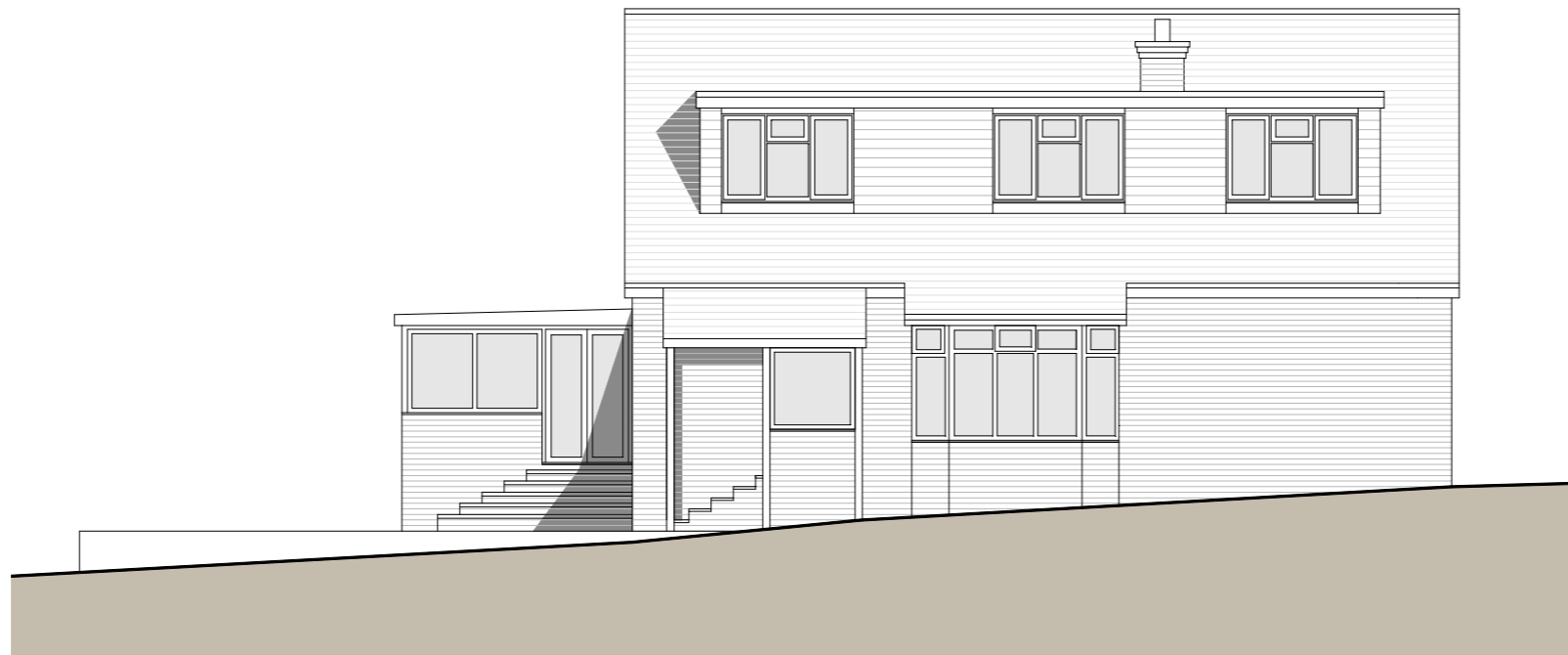
Side Elevation (south)