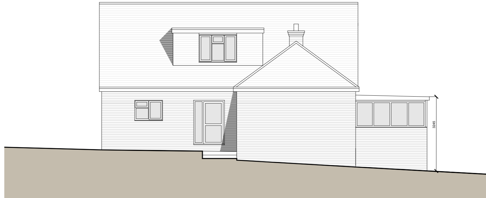
Side Elevation (north)