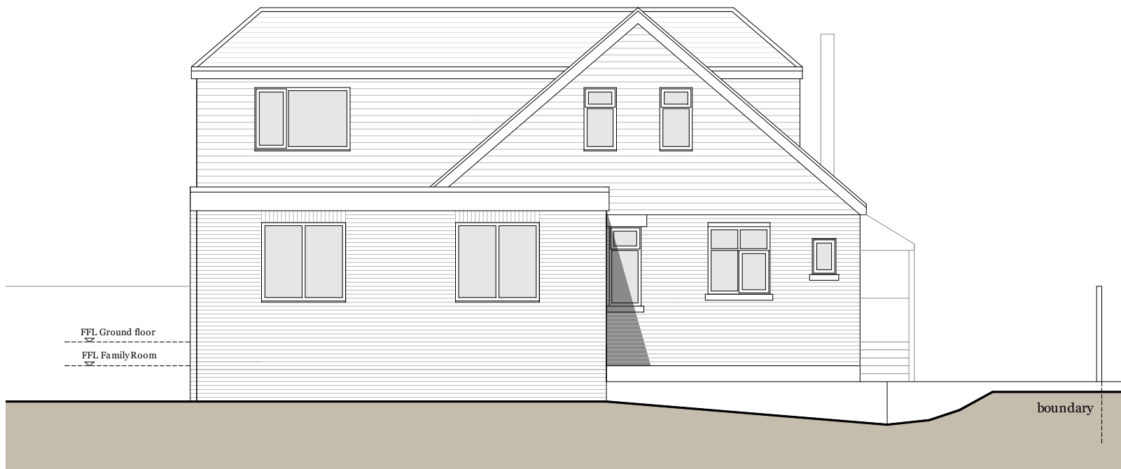
Rear Elevation (west)