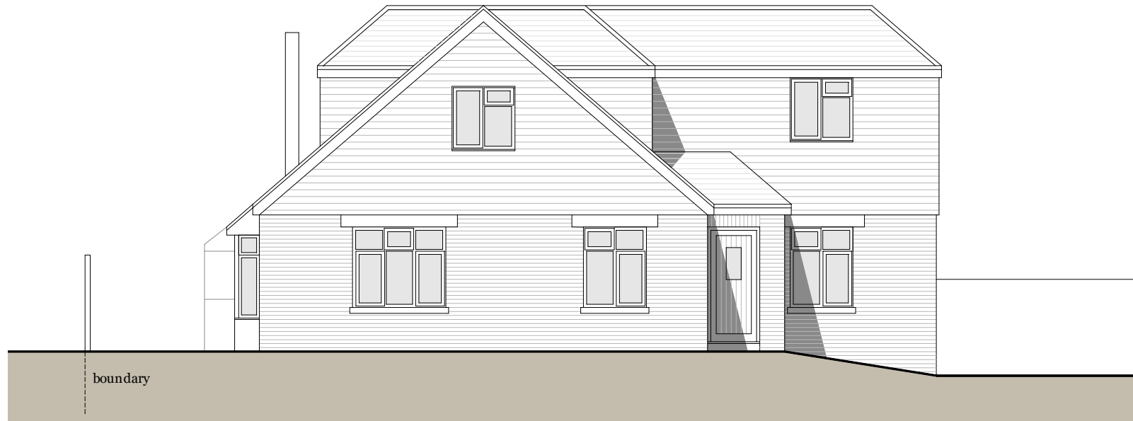
Front Elevation (east)