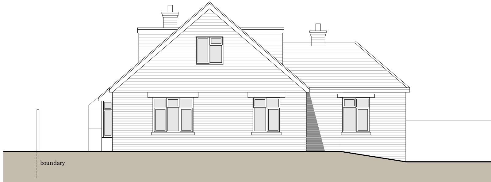
Front Elevation (east)