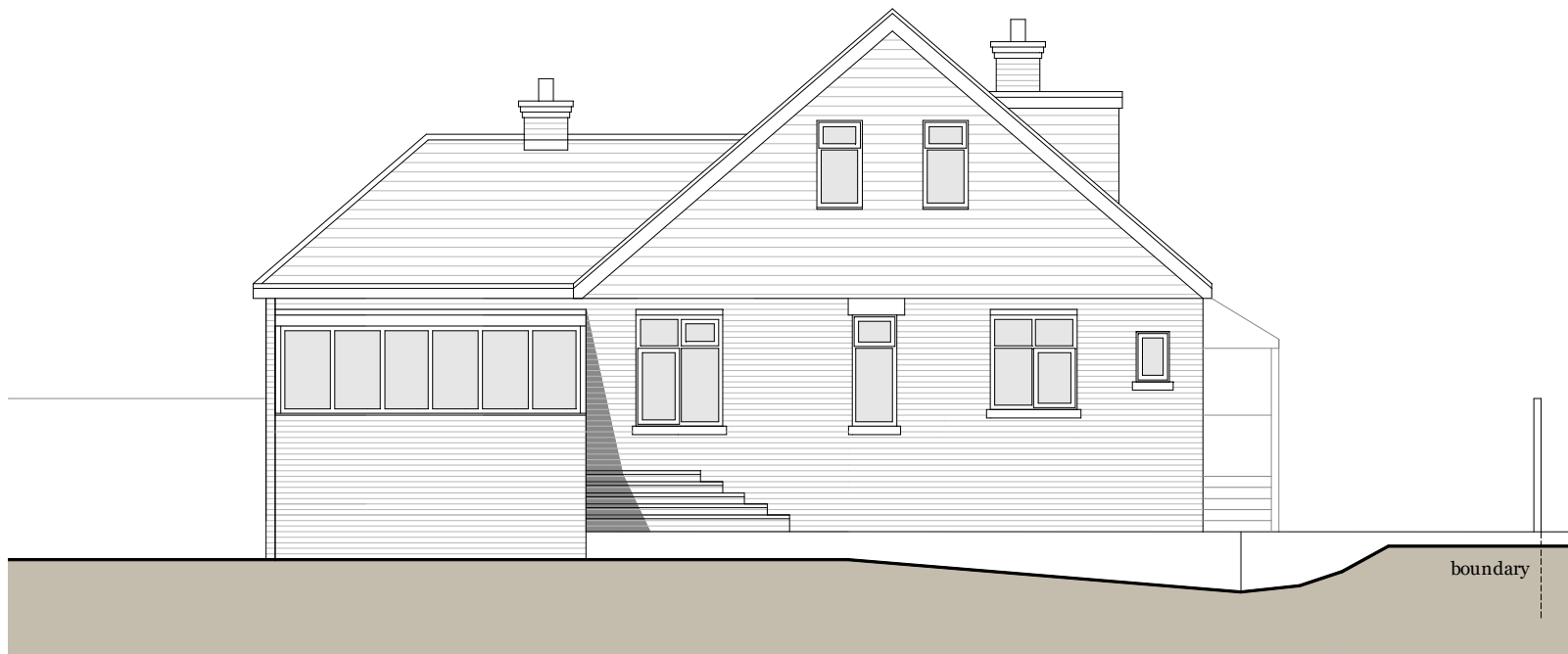
Rear Elevation (west)