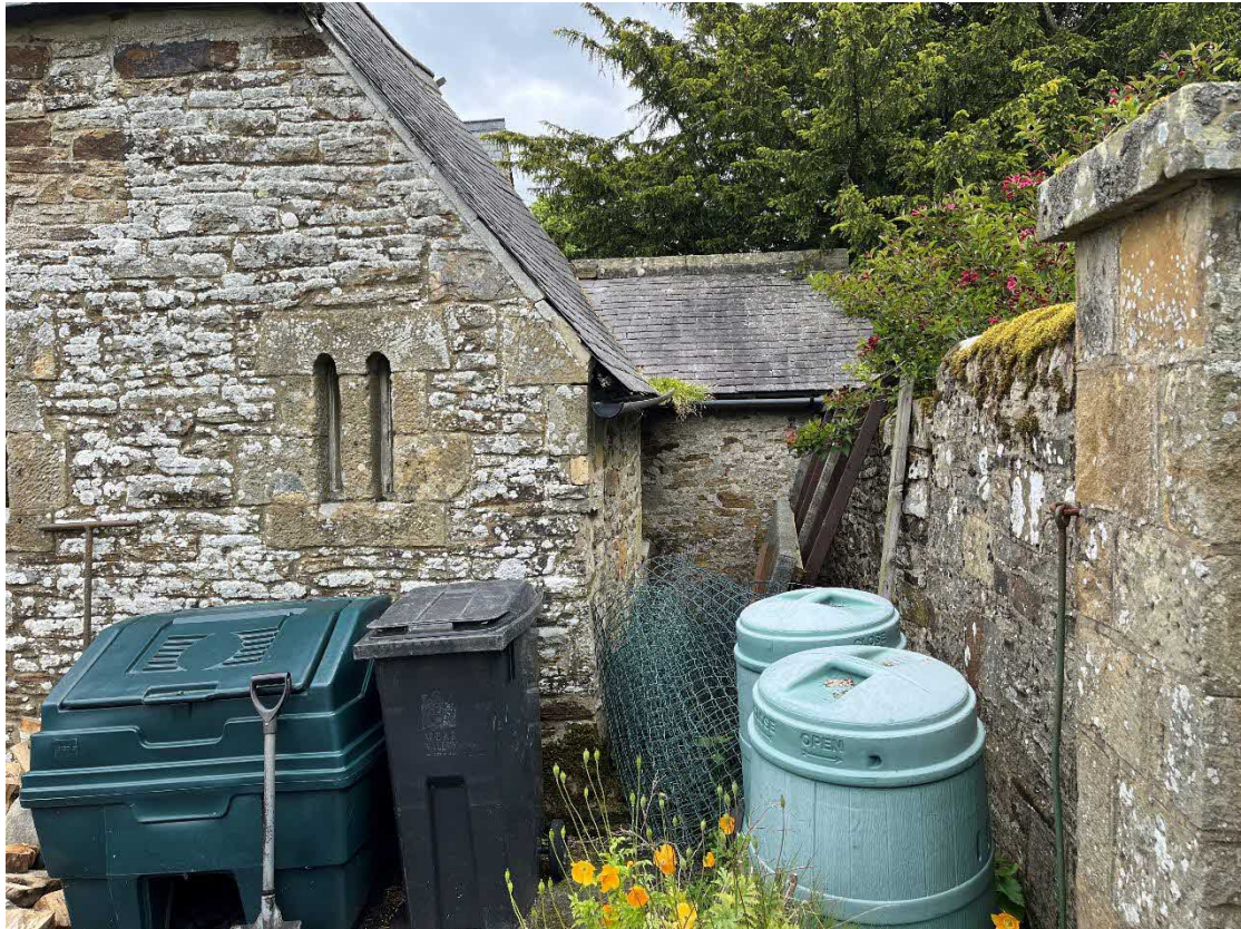
Southwest corner of building where infill structure intended to be formed