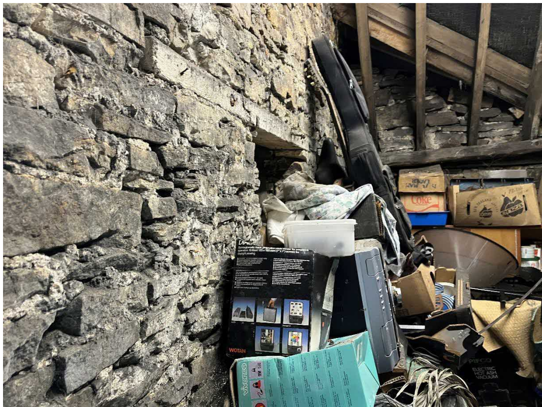
General internal photograph