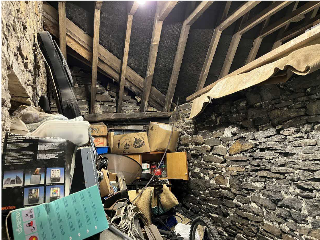
East side of outbuilding (internal wall to right side of photo to be partially removed)