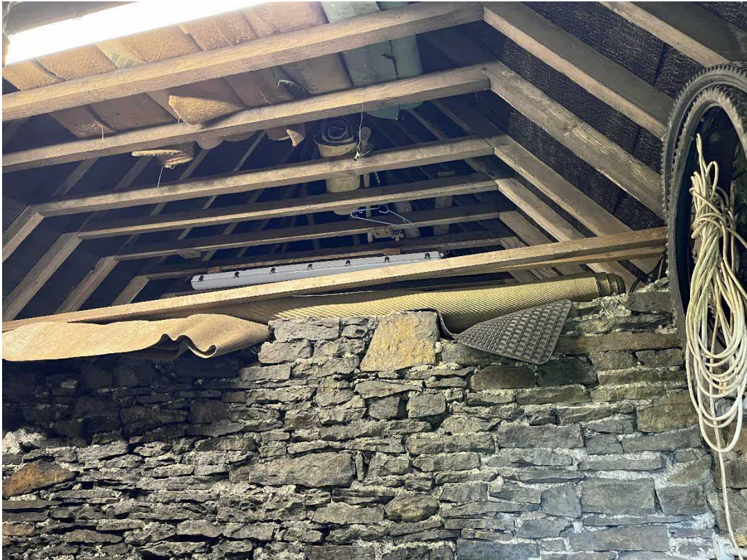
Items stored in roof Note modern felt covering below slates