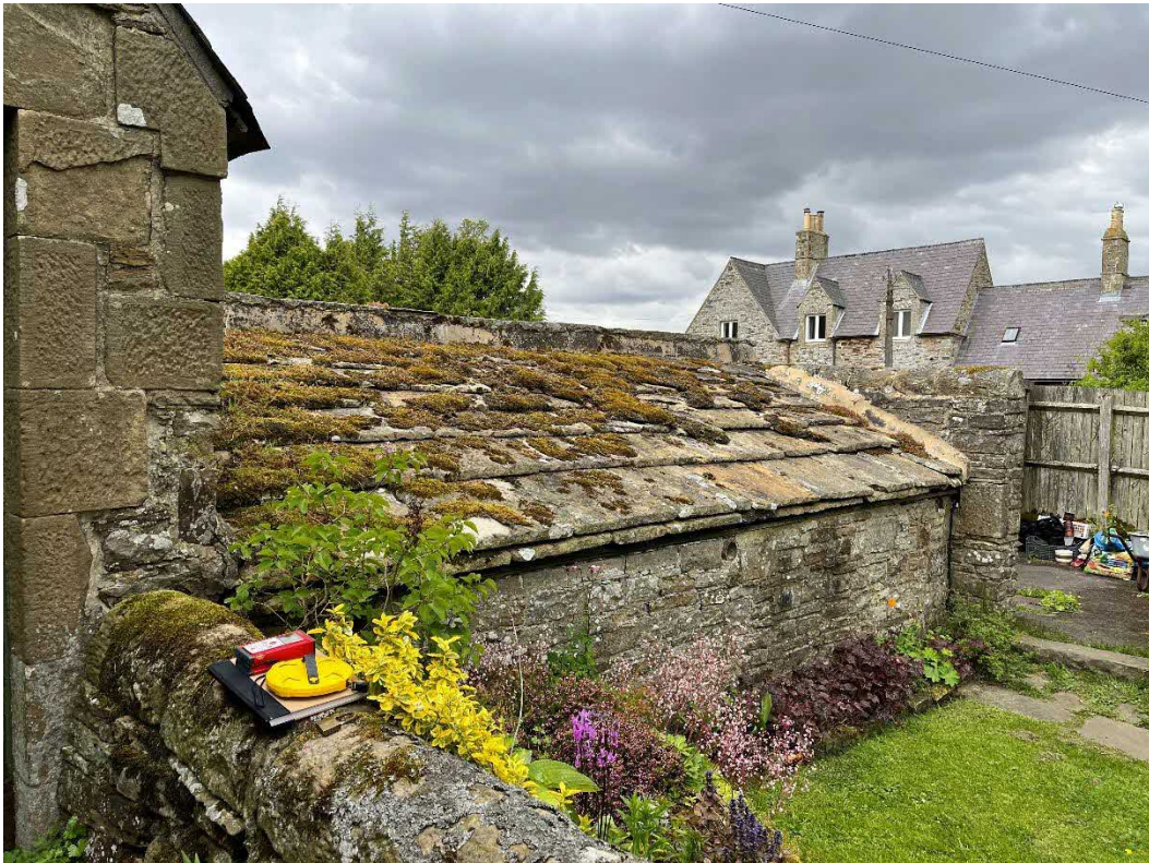
Looking west toward north offshoot