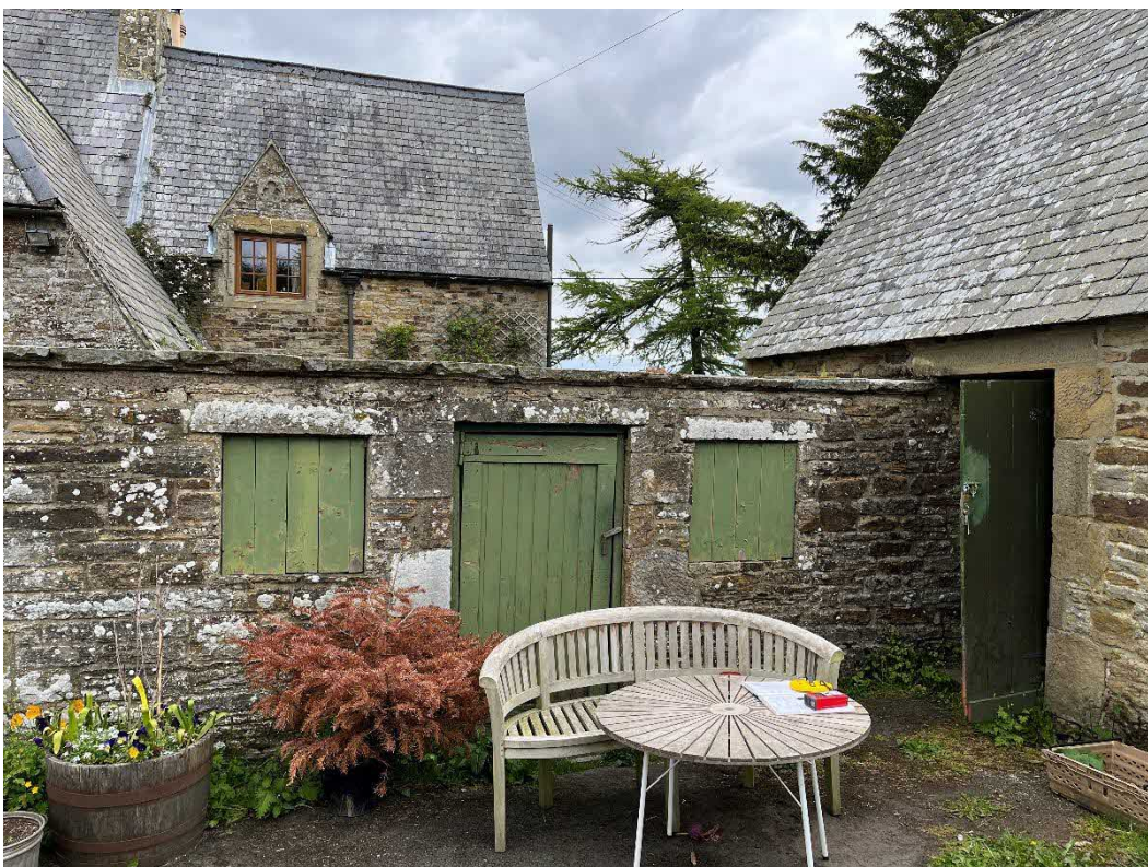
West elevation the north projection