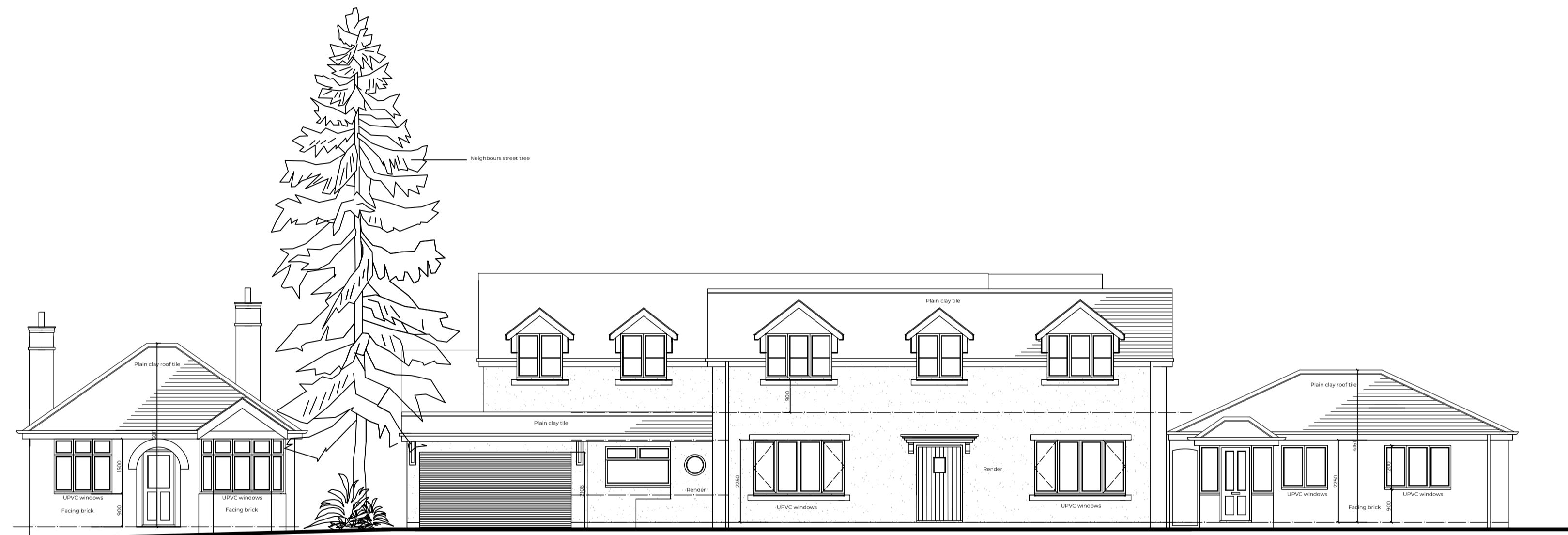
Street Elevation Extent of Prior Approvals (22/00900/HHPRIO) and (22/00930/HHPRIO)