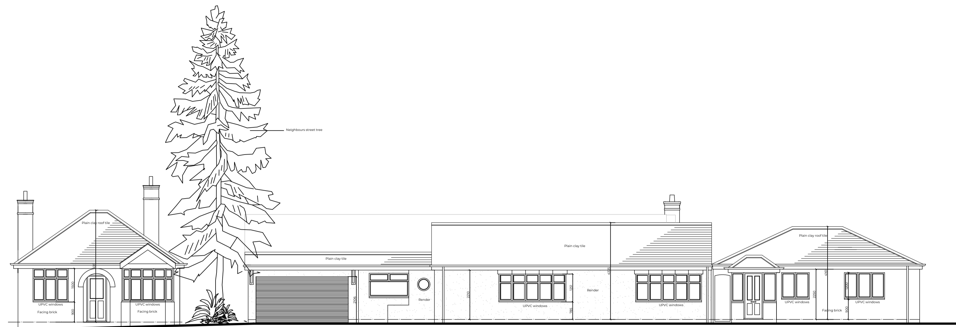
Street Elevation (As existing)