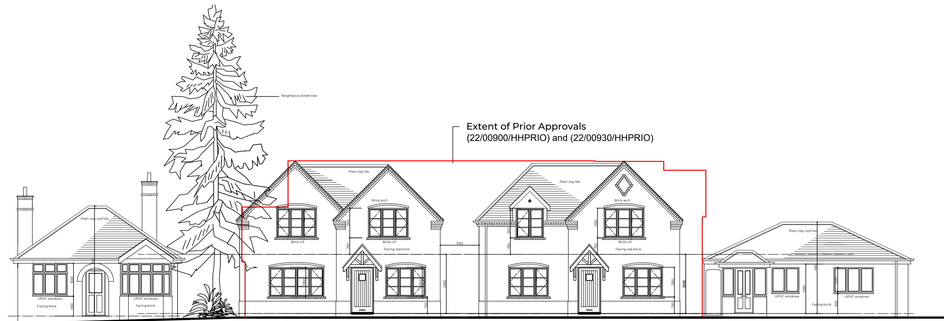
Street Elevation (As proposed)