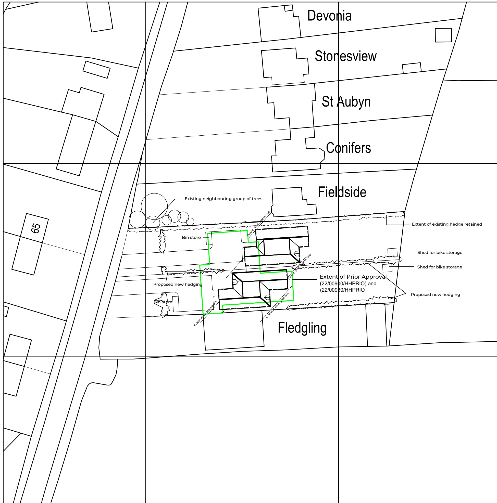
Site Plan as proposed Scale 1:500