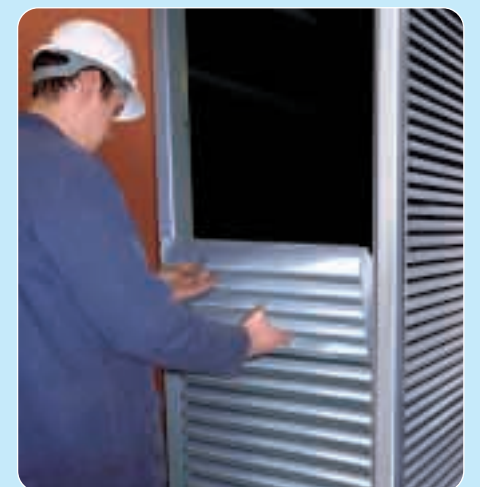
Manageable Lightweight Sections