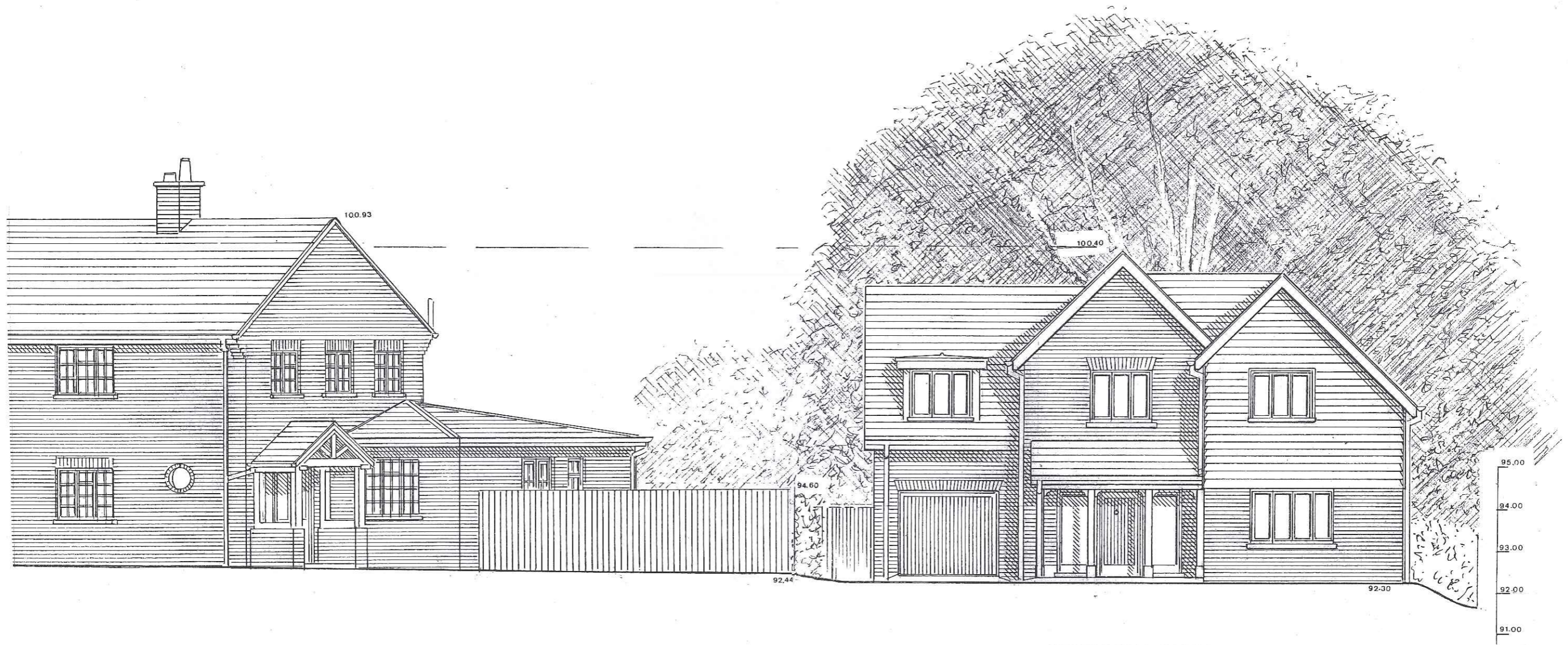
STREET SCENE ELEVATION