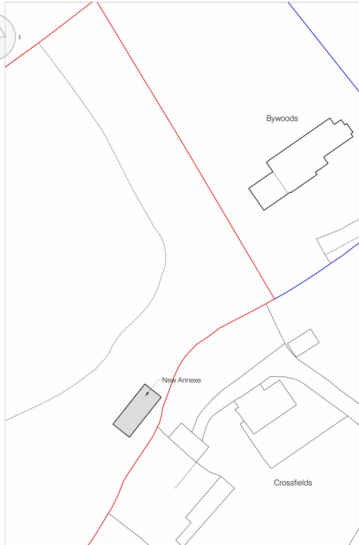
Proposed - SITE PLAN (BLOCK PLAN) 1:500