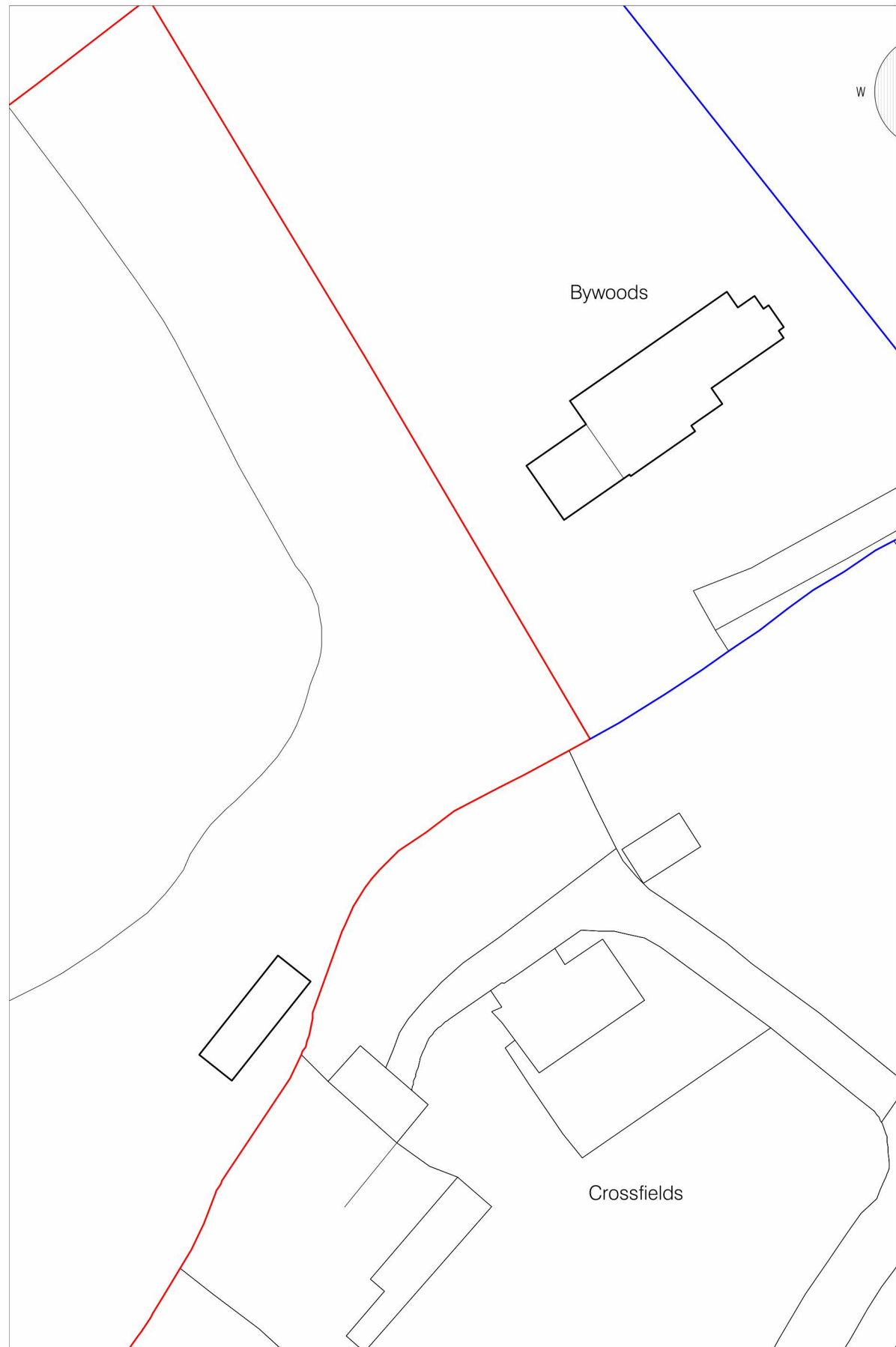
Existing - SITE PLAN (BLOCK PLAN) 1:500

This drawing is copyright and should not be reproduced without permission. Do not scale from drawing for construction. If in doubt contact main contractor before proceeding. The contractor is responsible for checking all information before any orders are placed or construction commences. All drawings to be read in conjunction with Structural Engineers' report, which takes precedence over all other specifications. Main contractor responsible for site safety.