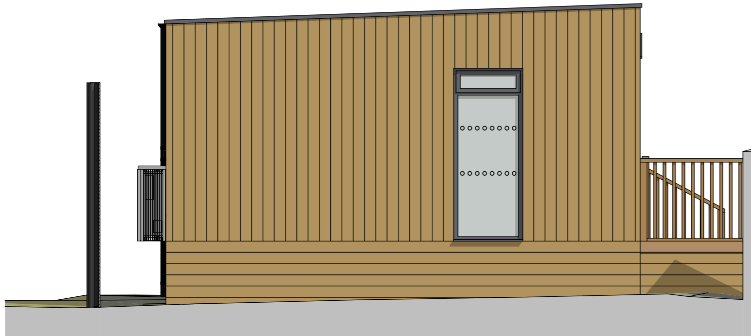
SIDE ELEVATION: 1:50 (SW)