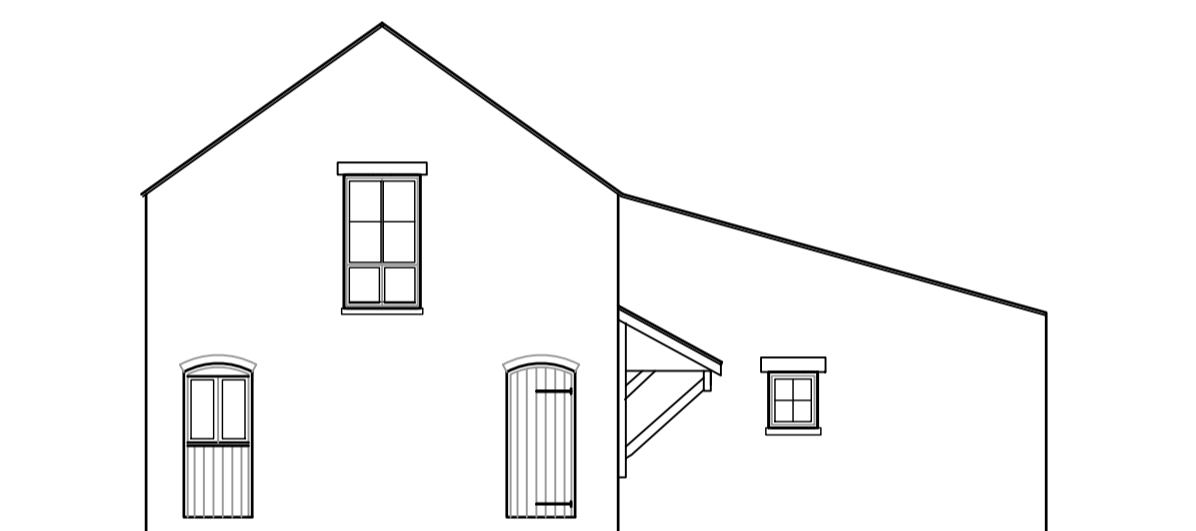
SIDE ELEVATION FACING SOUTH WEST