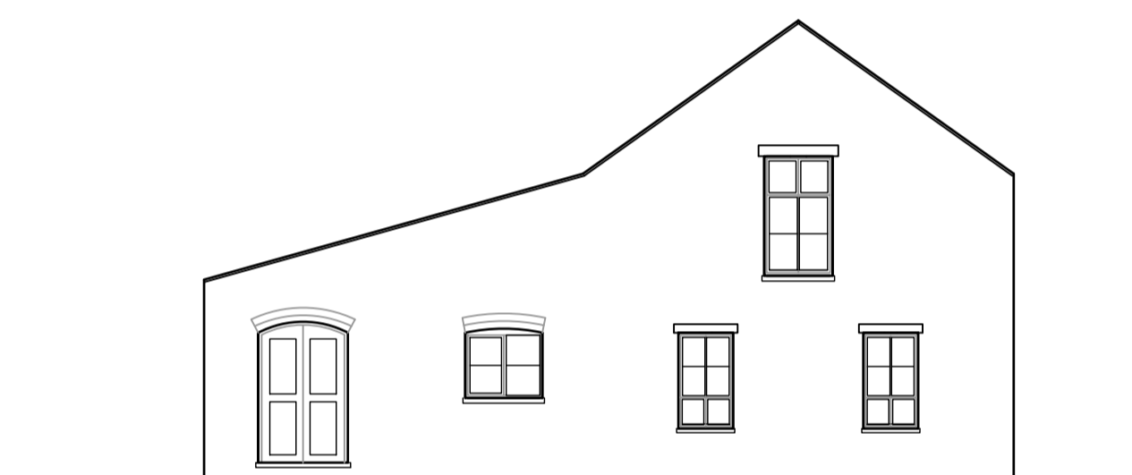
SIDE ELEVATION FACING NORTH EAST