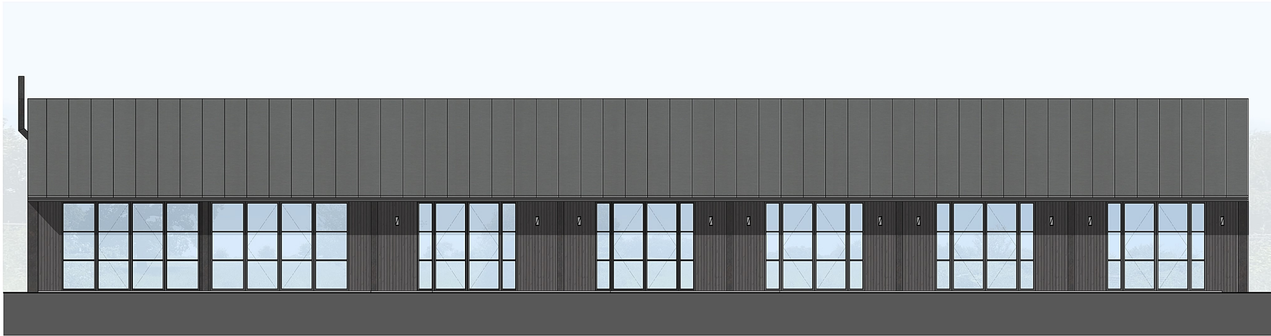
1 South Elevation

Materials: -Zinc roof -Dark timber facade -Dark timber window and door frames -Black UPVC rainwater goods