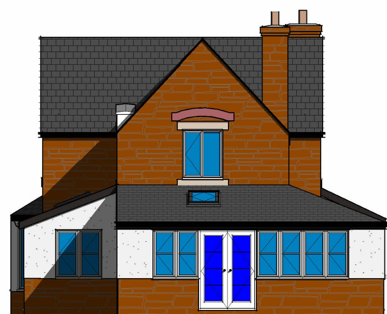
4 Right Side Elevation