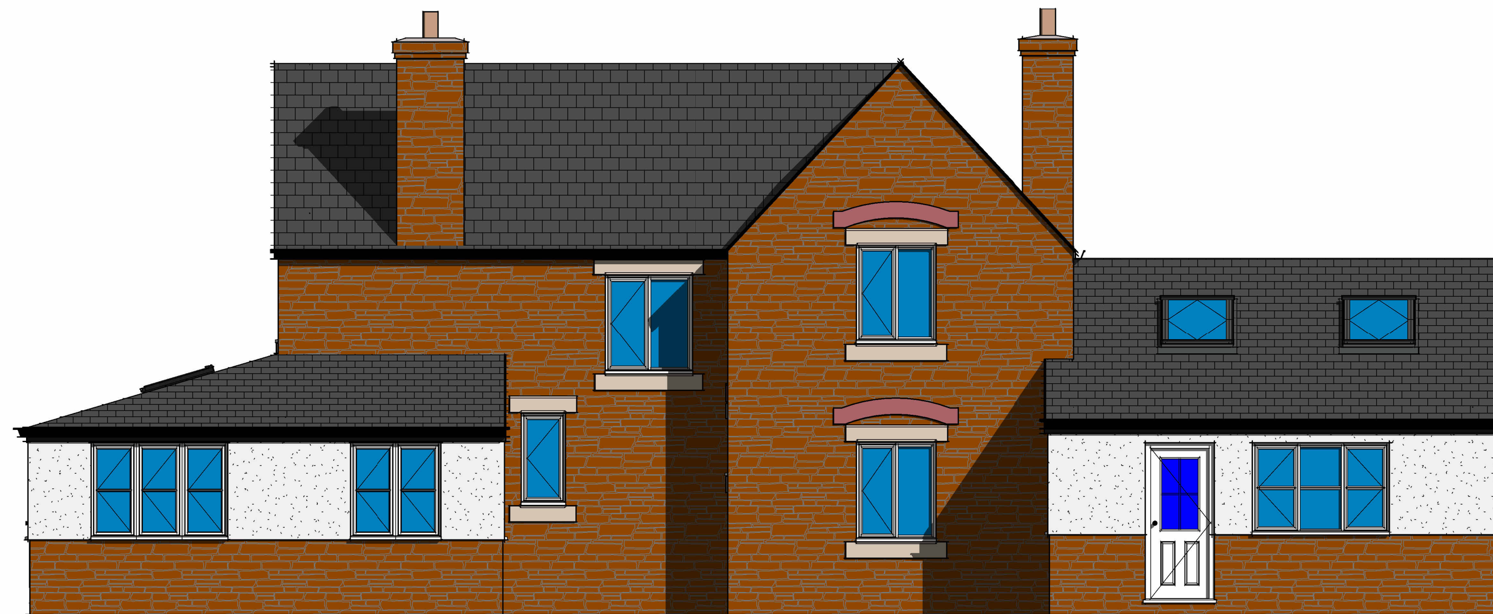
2 Rear Elevation