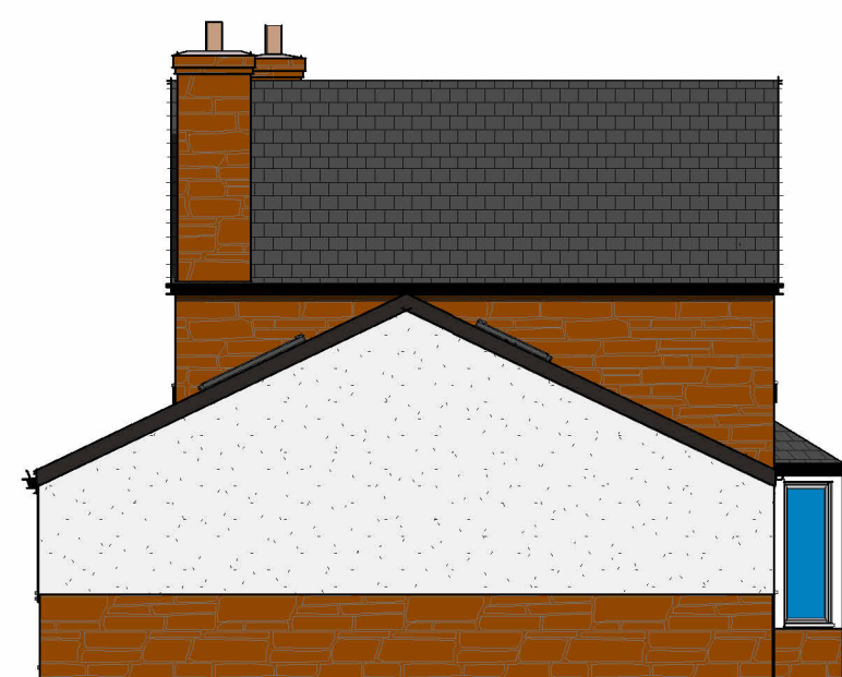
3 Left Side Elevation