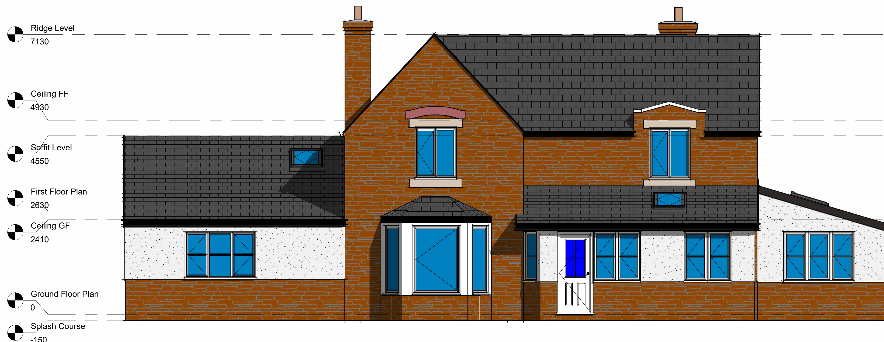
1 Front Elevation