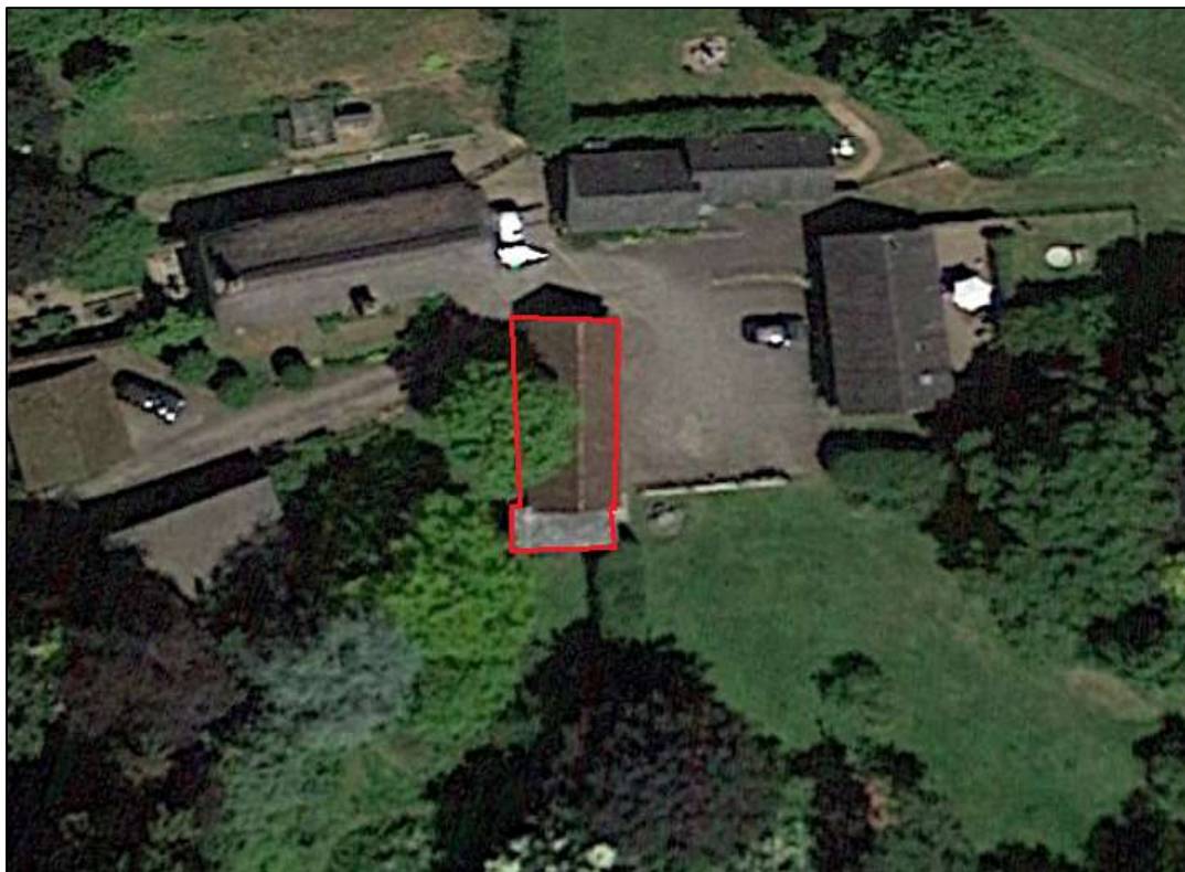
Figure 1. Location of the building. GoogleEarth June 2022.

SWE was commissioned by Mr & Mrs Ritchens to undertake an ecological assessment of a detached building at The Orchard Retreat, East Forde Farm, Cheriton Fitzpaine, Devon, EX17 4BA (Ordnance Survey grid reference SS878053– see Figure 1). The survey was required to support a planning application for replacement of the mono-pitch roof to the south elevation and the placement of two roof lights in the main roof (Drawing No. 1a; Architectural Services, July 2023). The Devon Wildlife Checklist is appended to this report.