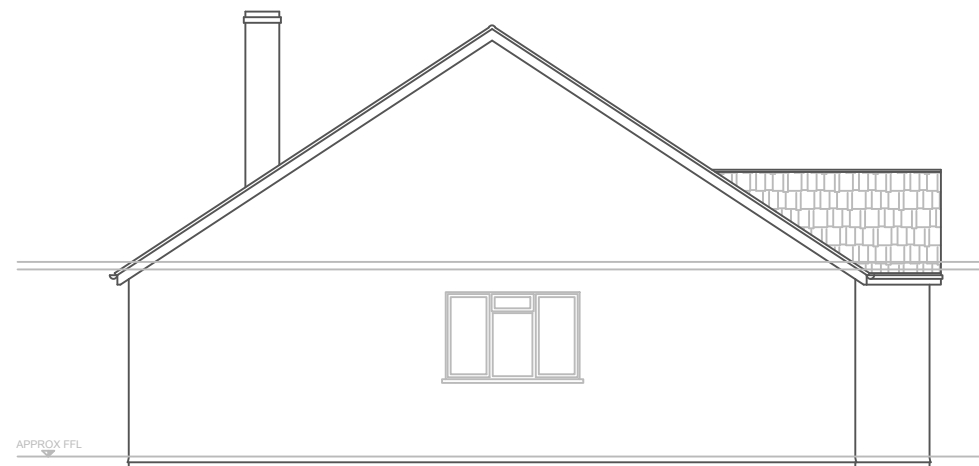
SIDE (NORTH EAST) ELEVATION