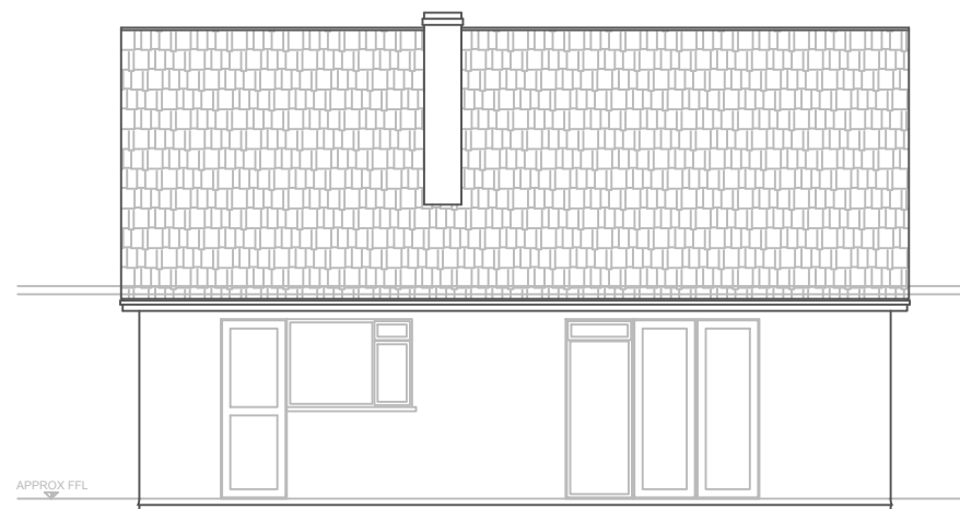
REAR (SOUTH EAST) ELEVATION