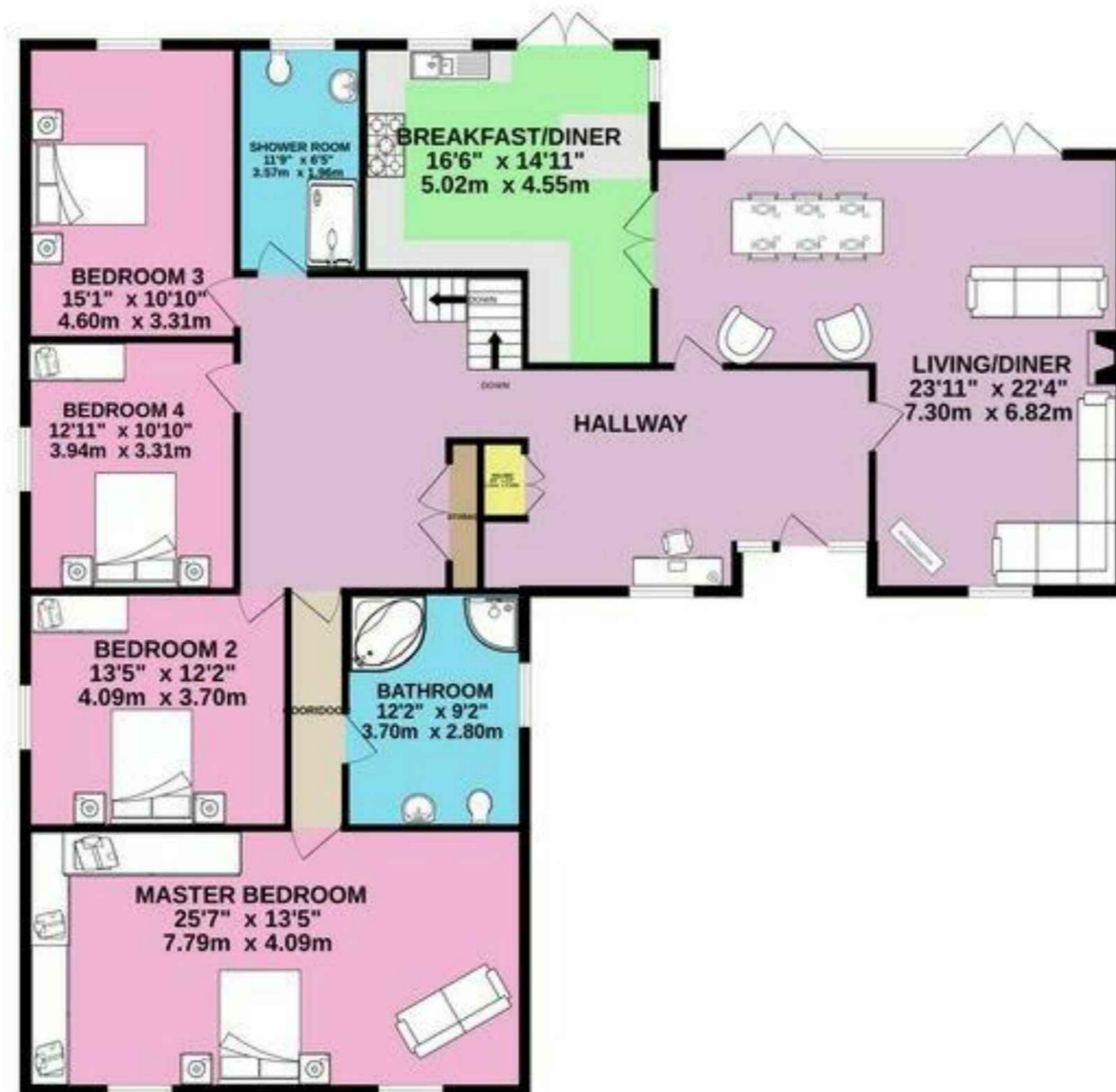
FIRST FLOOR PLAN - HOLIDAY LET