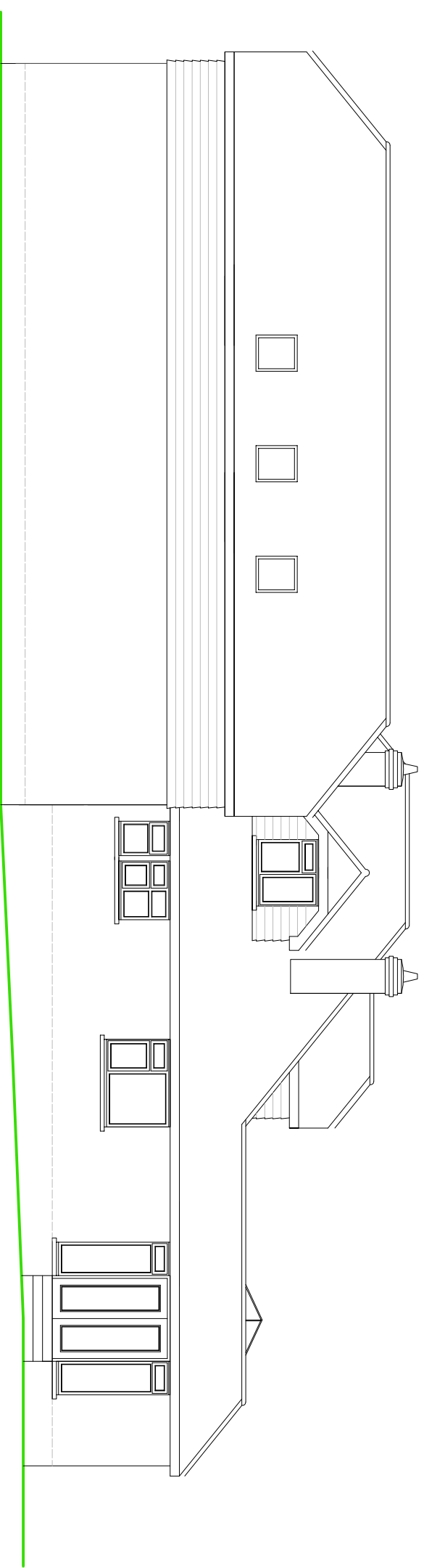
REAR (EAST) ELEVATION