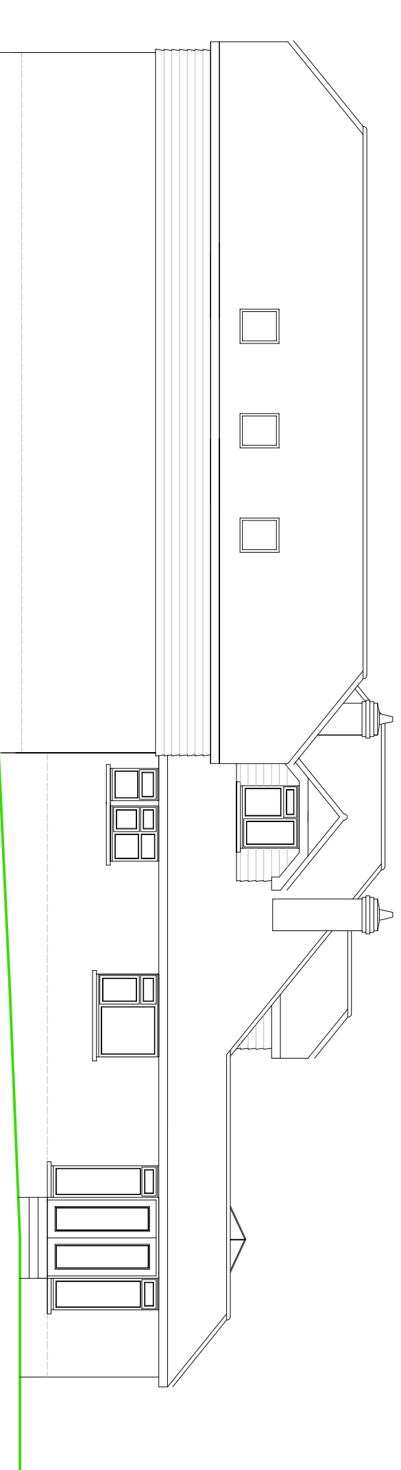
REAR (EAST) ELEVATION