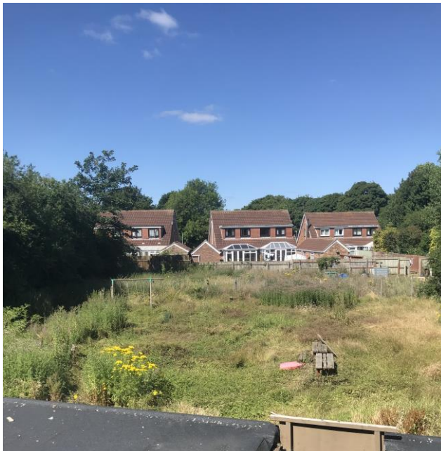
The above photo shows the garden pre development.

SOUTTERGATE 1. 5266 (West Side) Station Hotel TA 1828 NE 1/99 II 2. Early or mid C19. Brown brick. Hipped slate roof. Two storeys. Band. North elevation has 3 ranges of cased sashes with glazing bars, central one breaking forward, and crowned by planked gable with wooden finial. East elevation has 4 ranges of sashes.