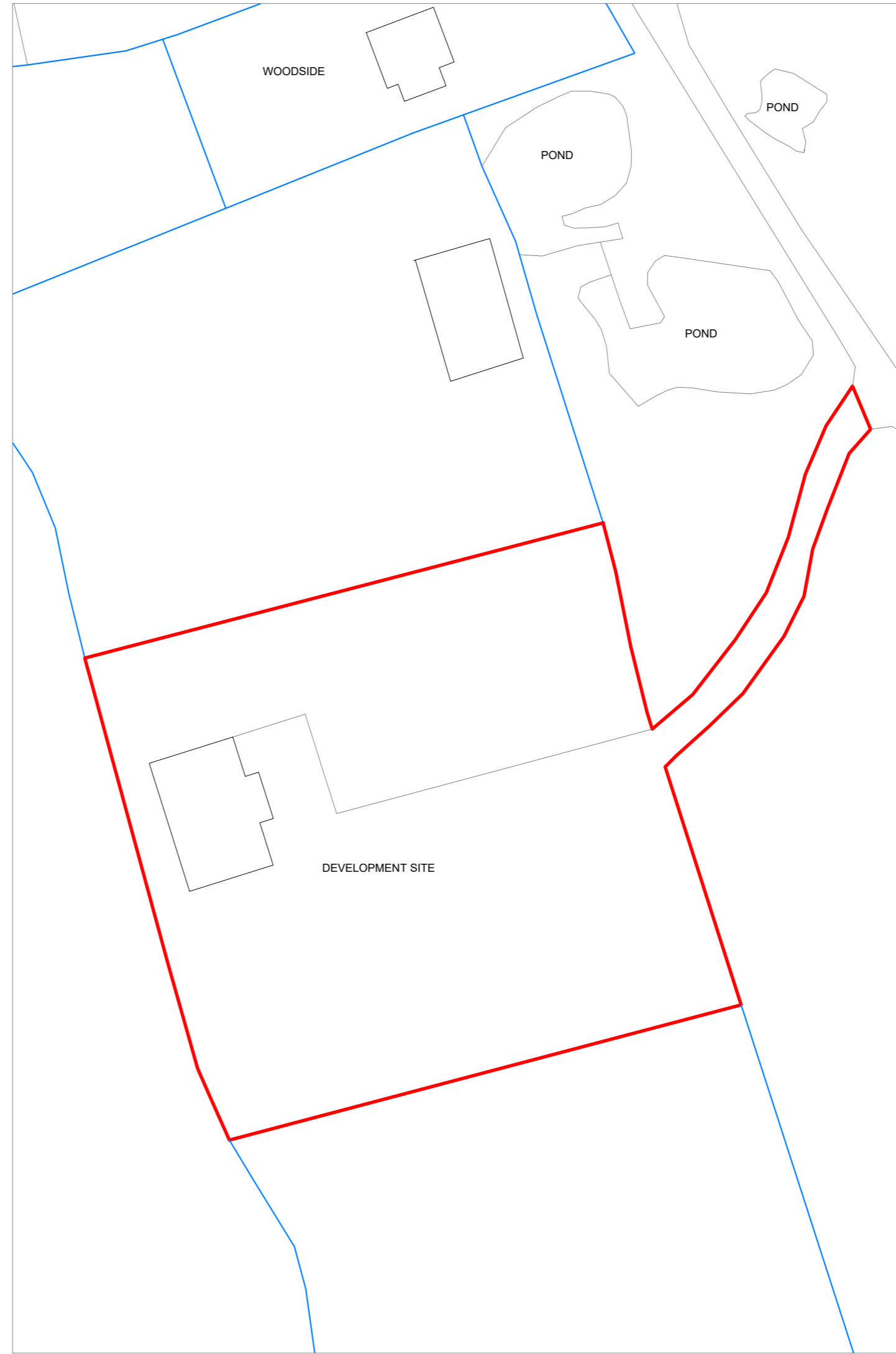
2 Proposed Block Plan 1:500