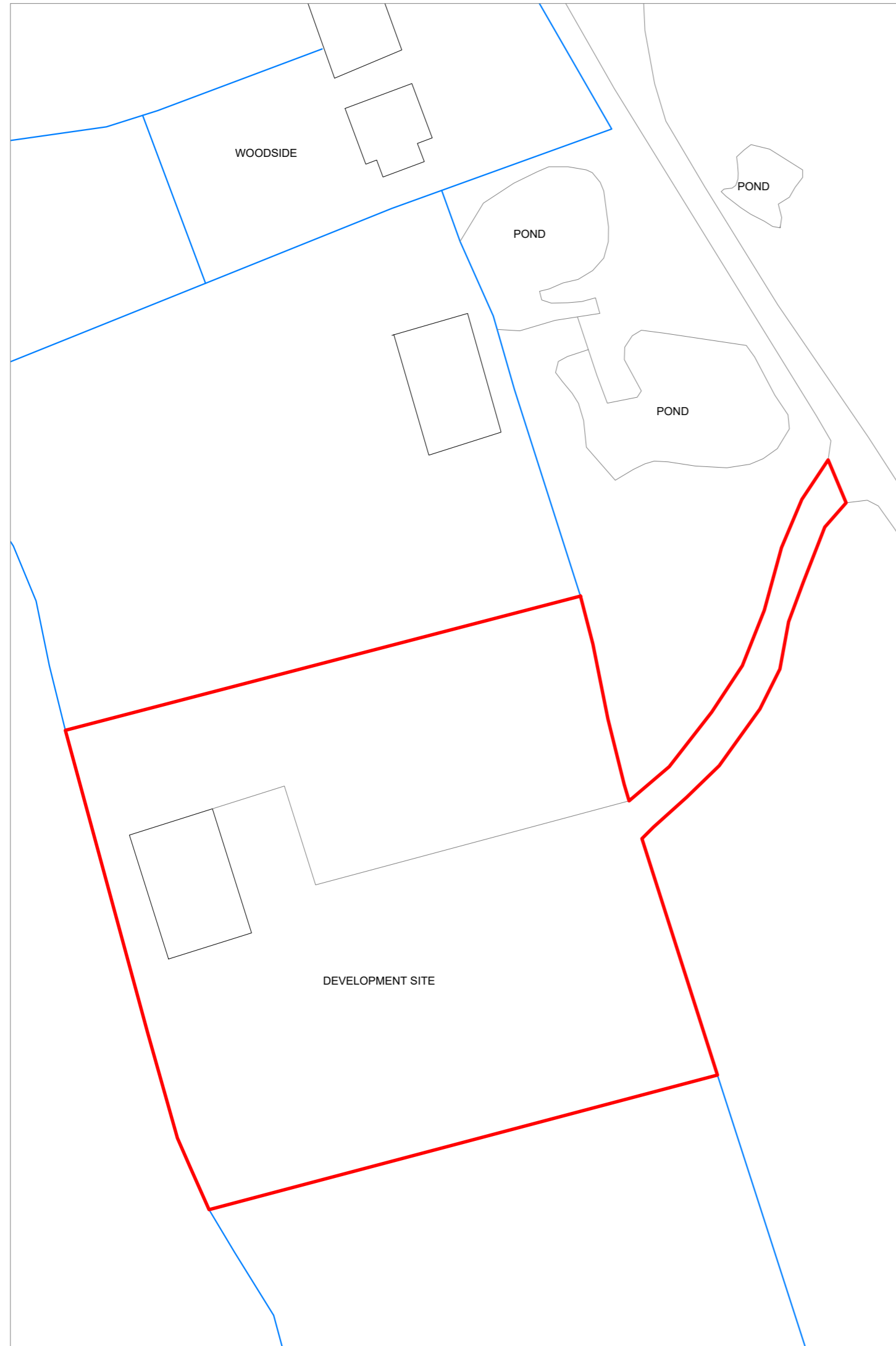
1 Existing Block Plan 1:500