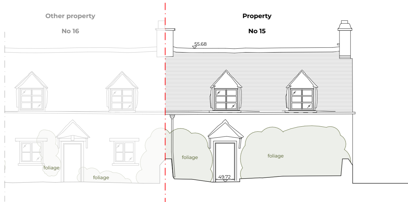
West Elevation 1:100 scale