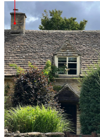
Please find chimney details on drawing no K2305-05