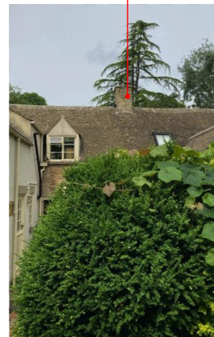
Please find chimney details on drawing no K2305-05