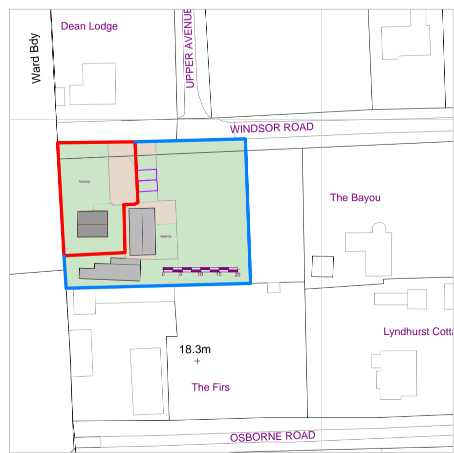
Existing Location Plan - 1:1000 North