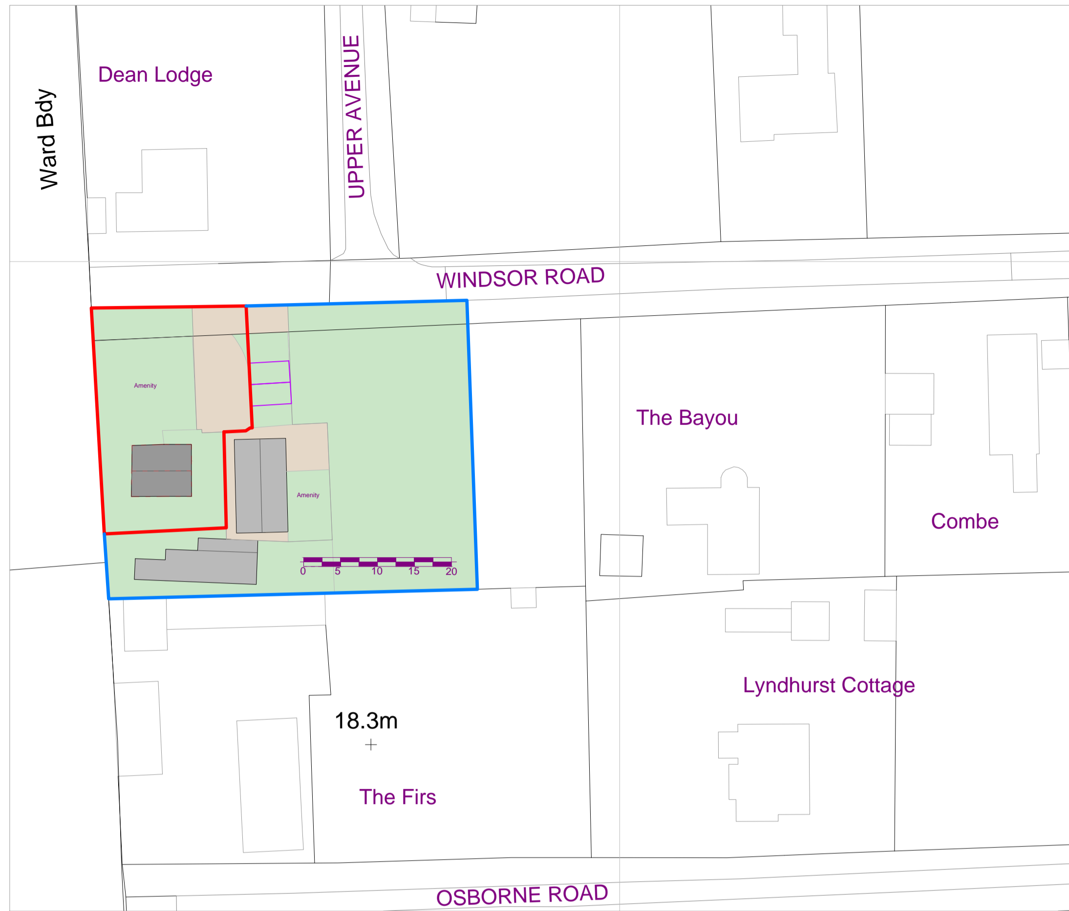
Existing Location Plan - 1:500