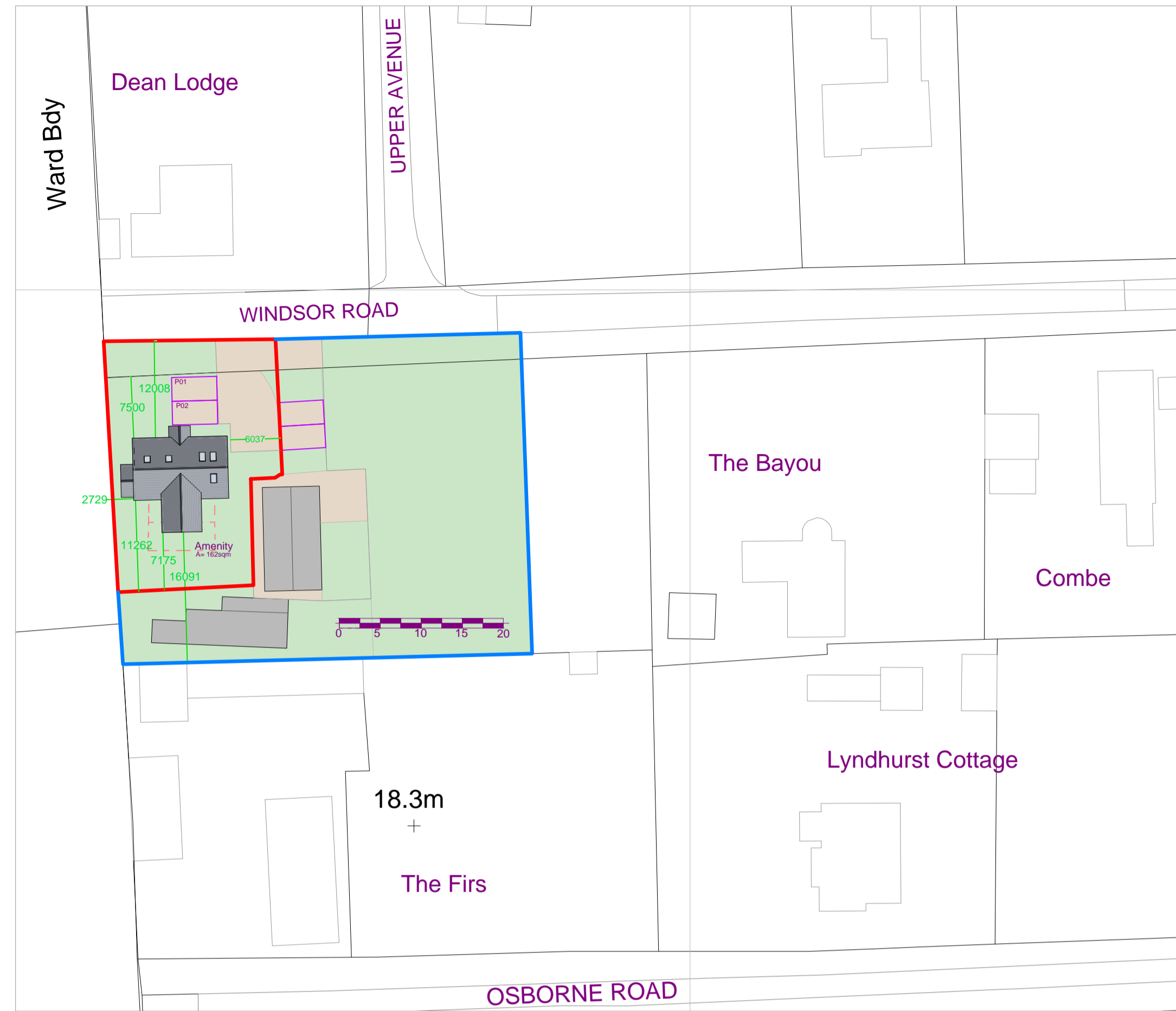
Proposed Location Plan - 1:500