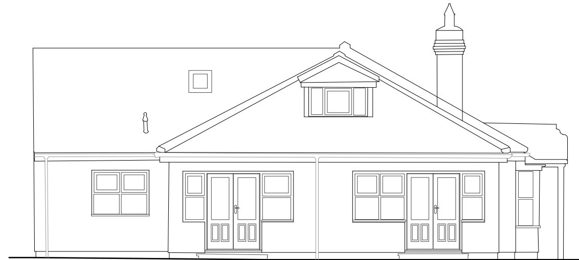
3 Existing Side Elevation Scale: 1:100