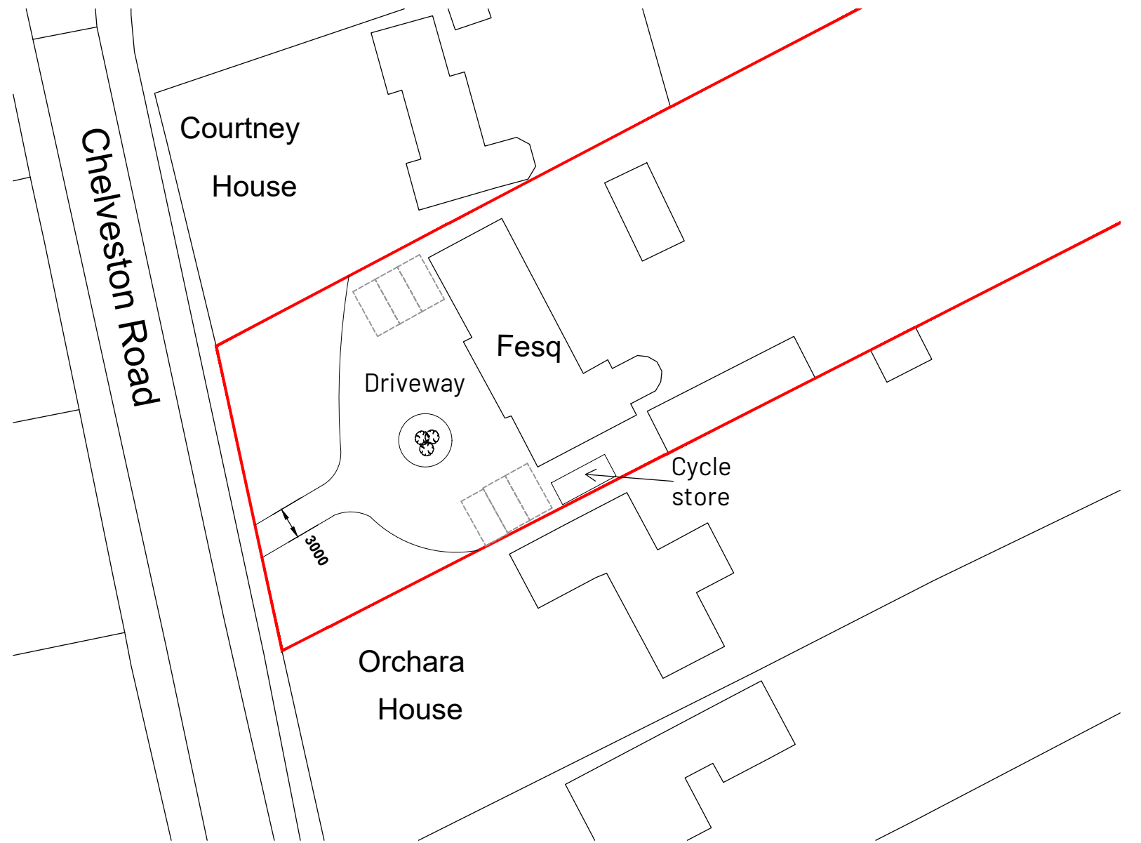
BLOCK PLAN & PARKING PLAN 1:500