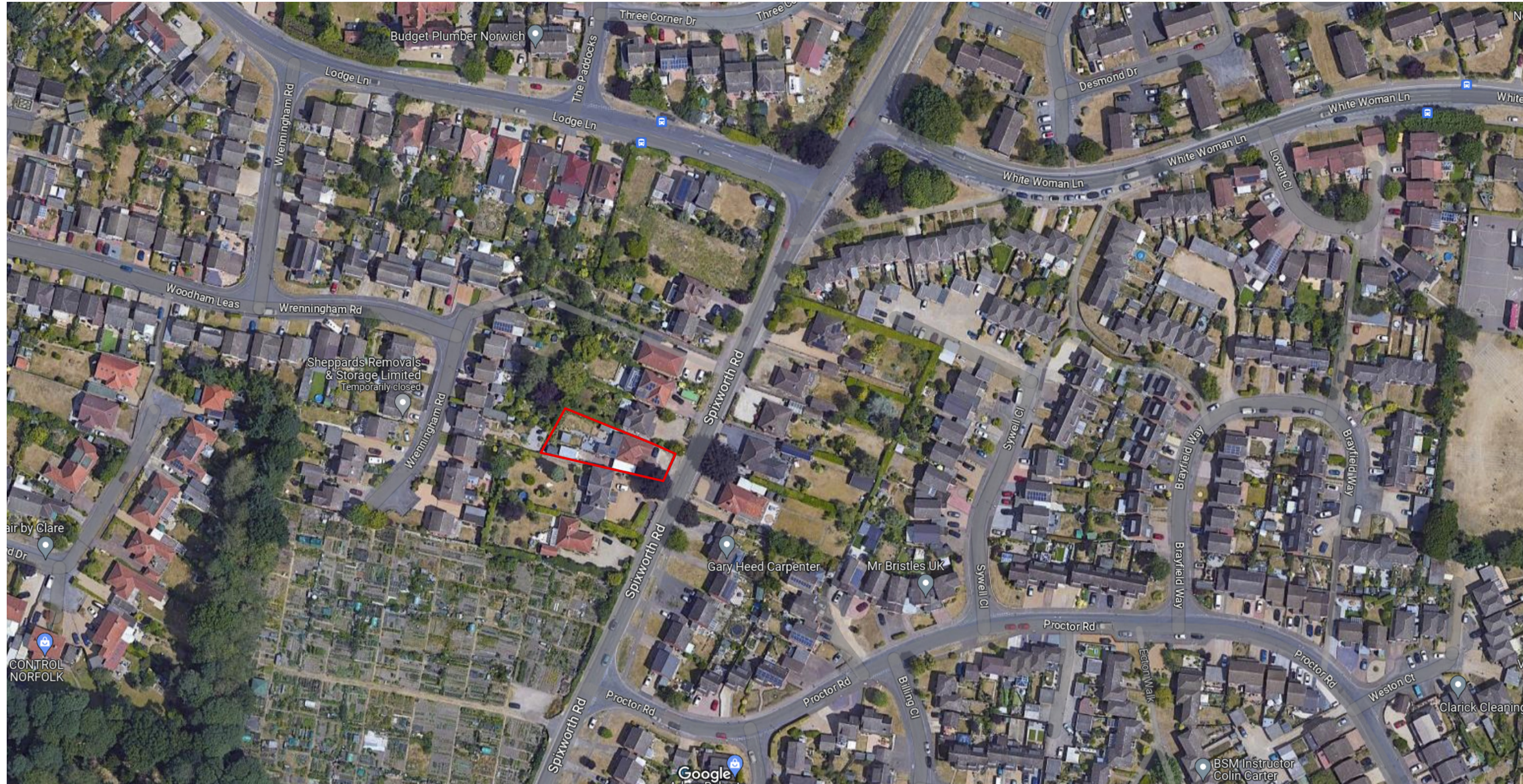
Site Location Plan - Google Maps 1 : 1250