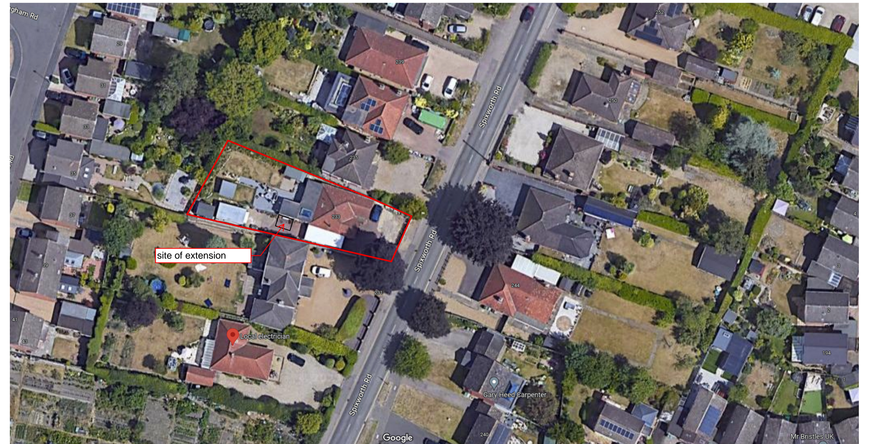
Site Block Plan - Google Maps 1 : 500