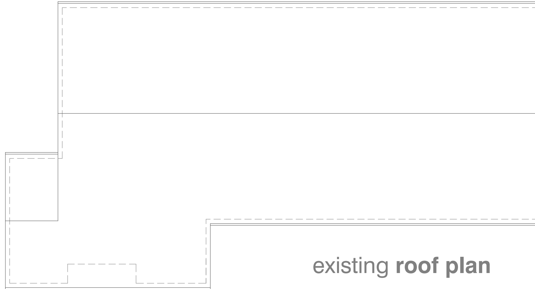
existing roof plan

BROTHERTON HALL ST JOHNS RENFIELD CHURCH