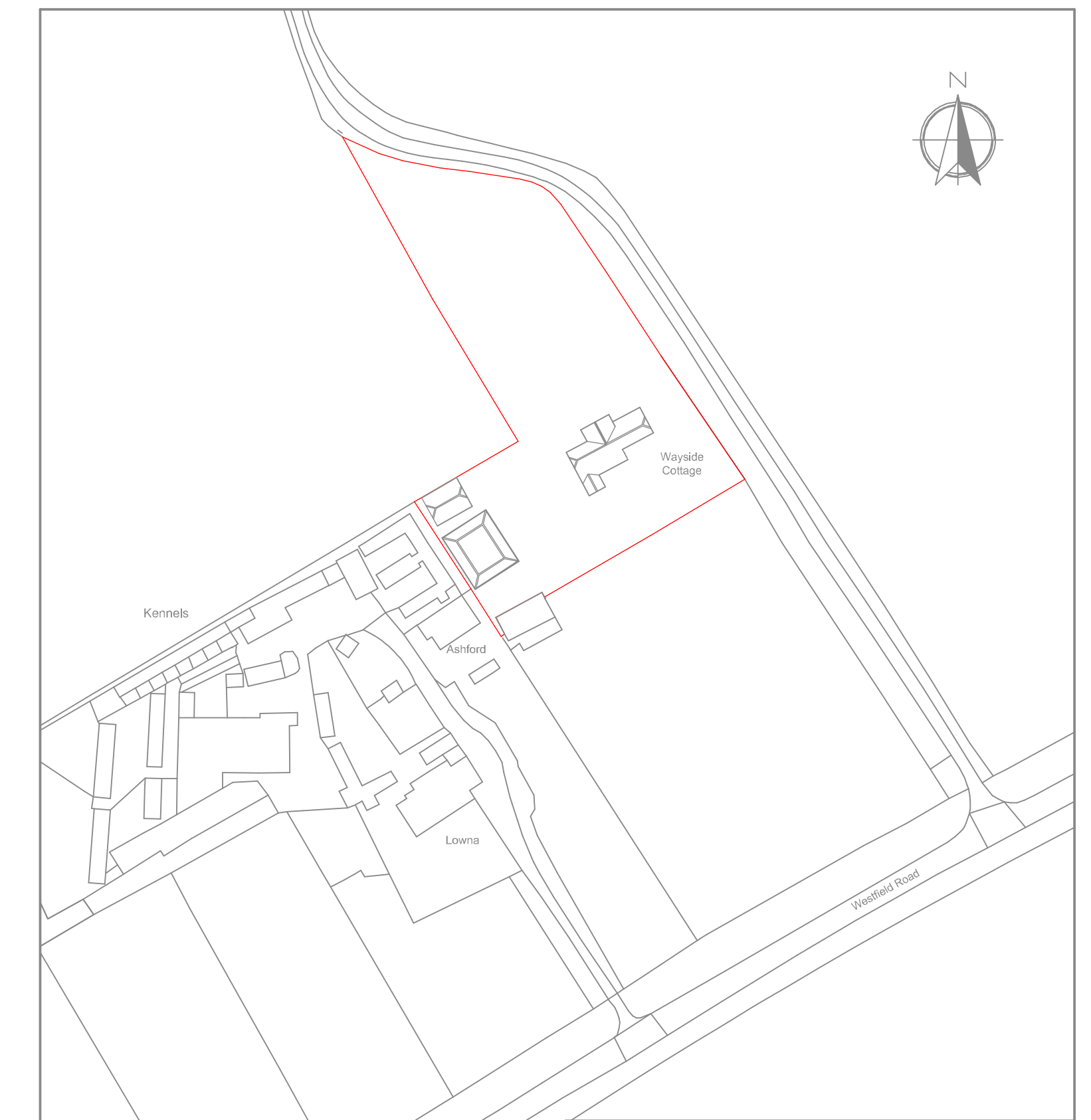
Location plan Scale 1 : 1250 @ A1