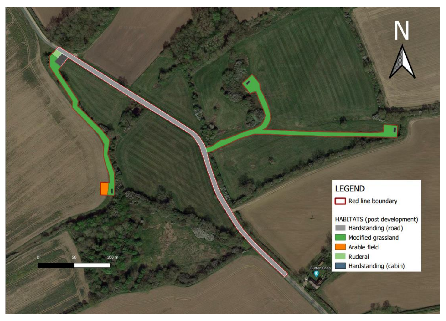
Annex 2 – Habitats Post Development