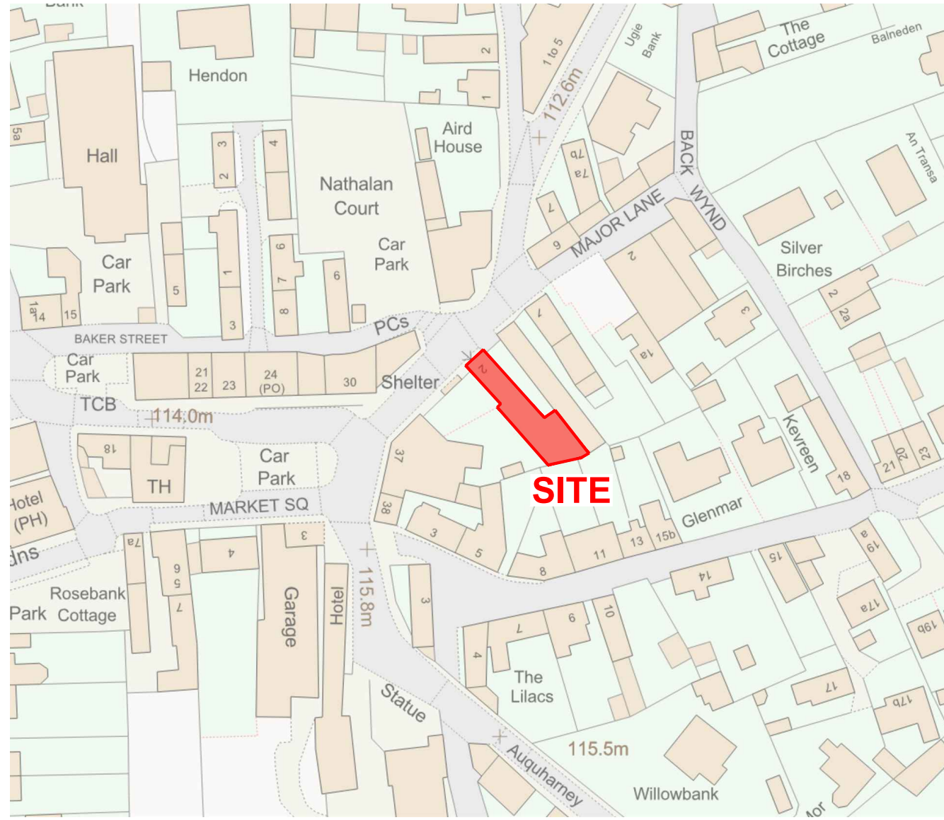
LOCATION PLAN Scale 1:1250@A3