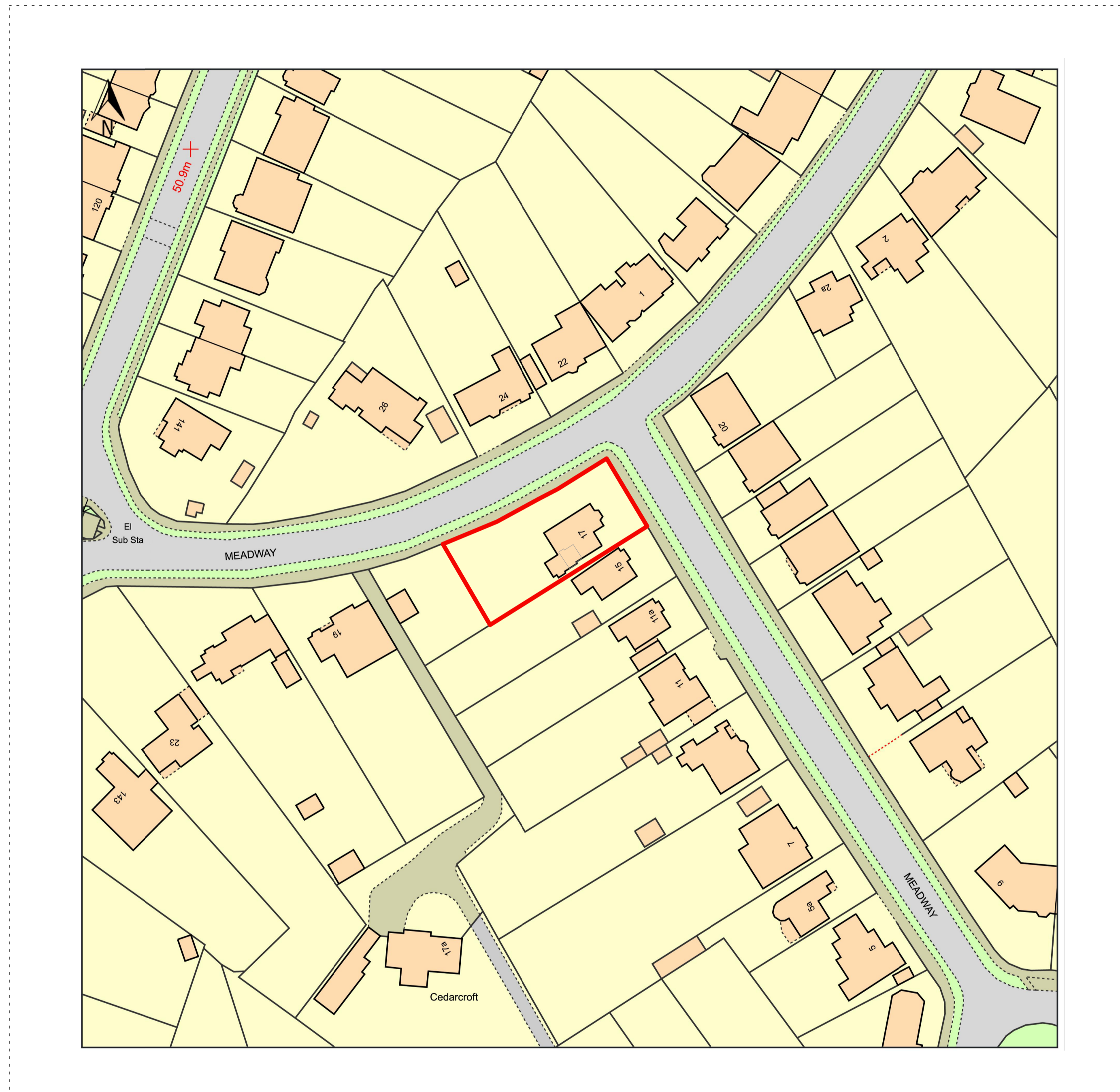
LOCATION PLAN 1:1250@A3

Notes Do not scale from drawing unless for planning purposes. All dimensions to be checked on site. All levels to be checked on site. All setting out must be checked on site. This drawing is copyright WhitemanDesign. This drawing must not be used onsite unless 'Issued for Construction'.