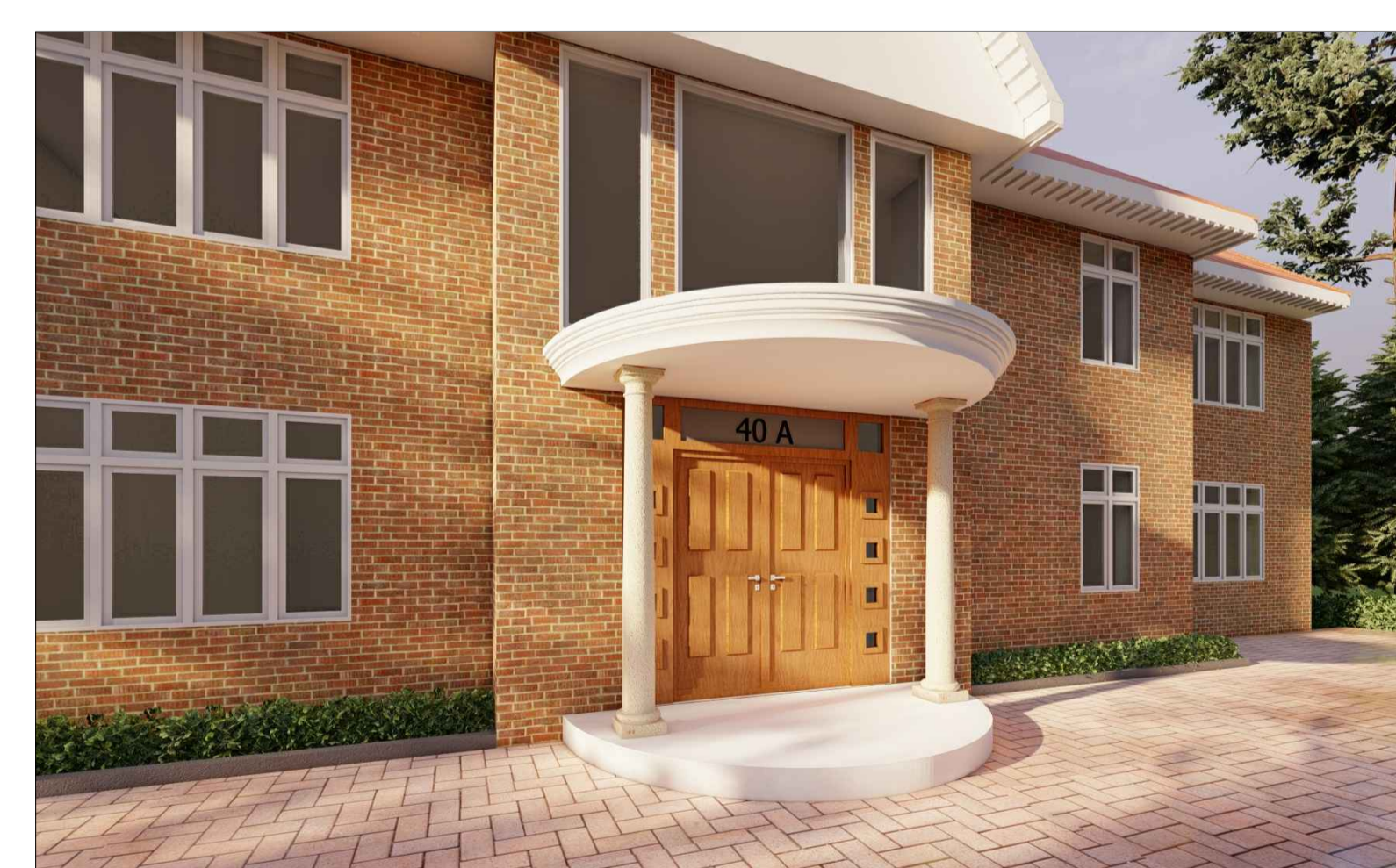
PROPOSED PORCH 3D VIEW