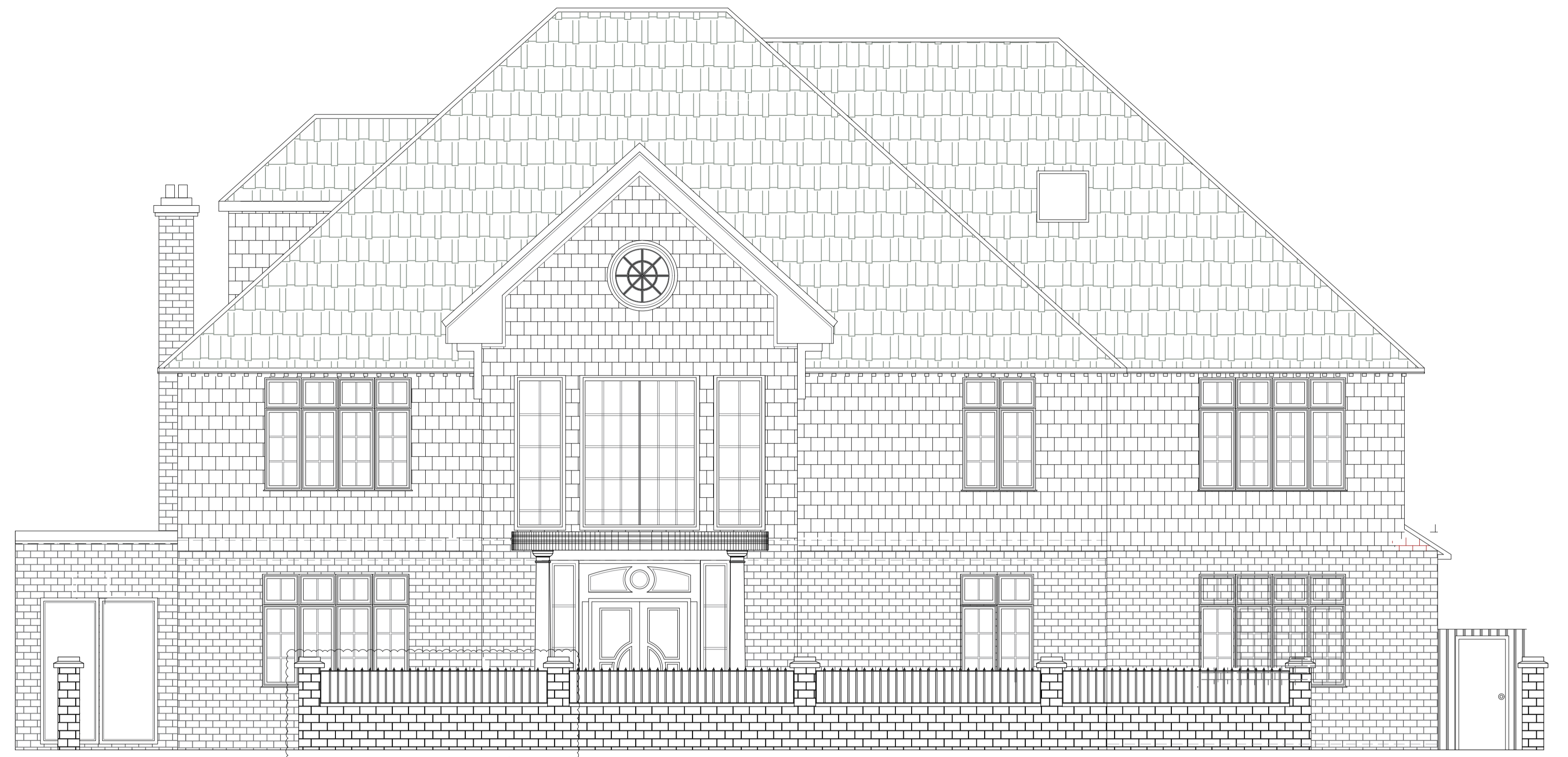
PROPOSED STREET VIEW ELEVATION SCALE 1:50