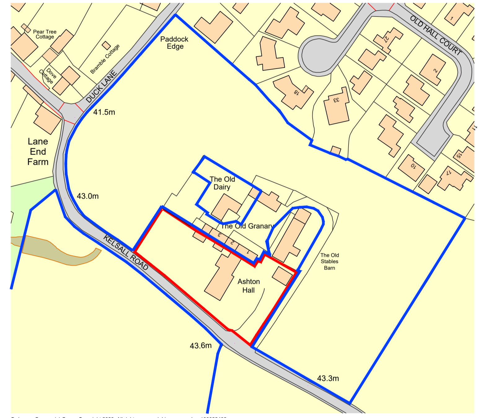
BLOCK PLAN 1 : 500