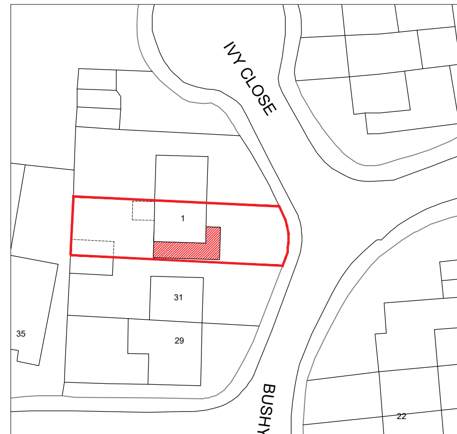
SITE BLOCK PLAN 1:500 (proposed)