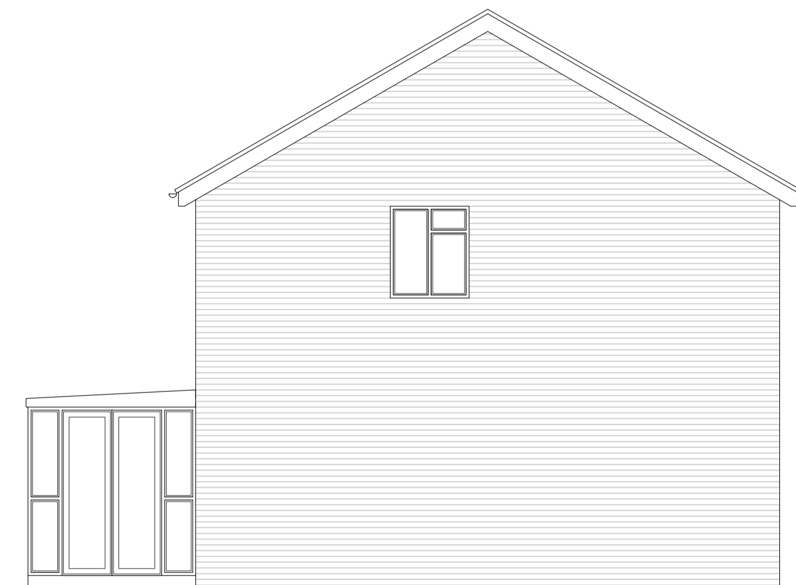
SIDE ELEVATION 1:50