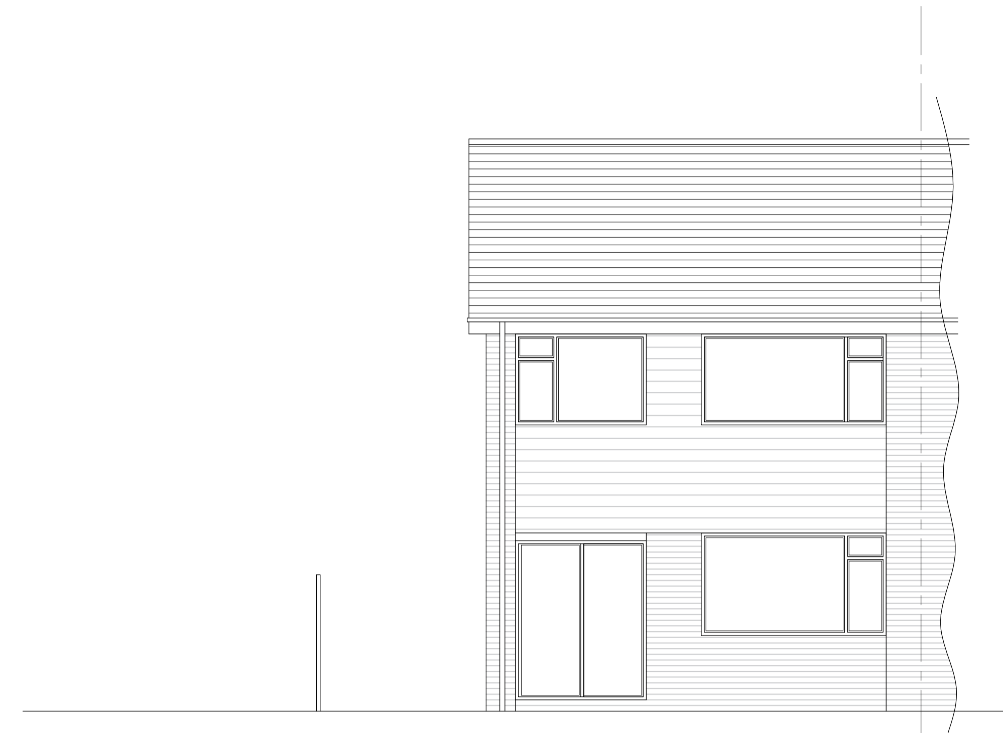
FRONT ELEVATION 1:50