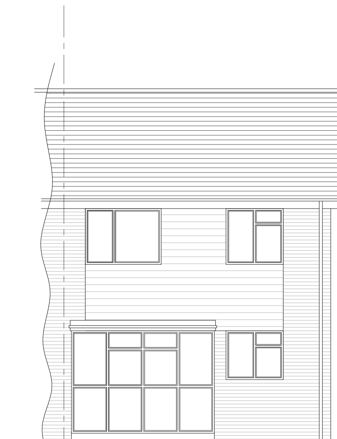
REAR ELEVATION 1:50