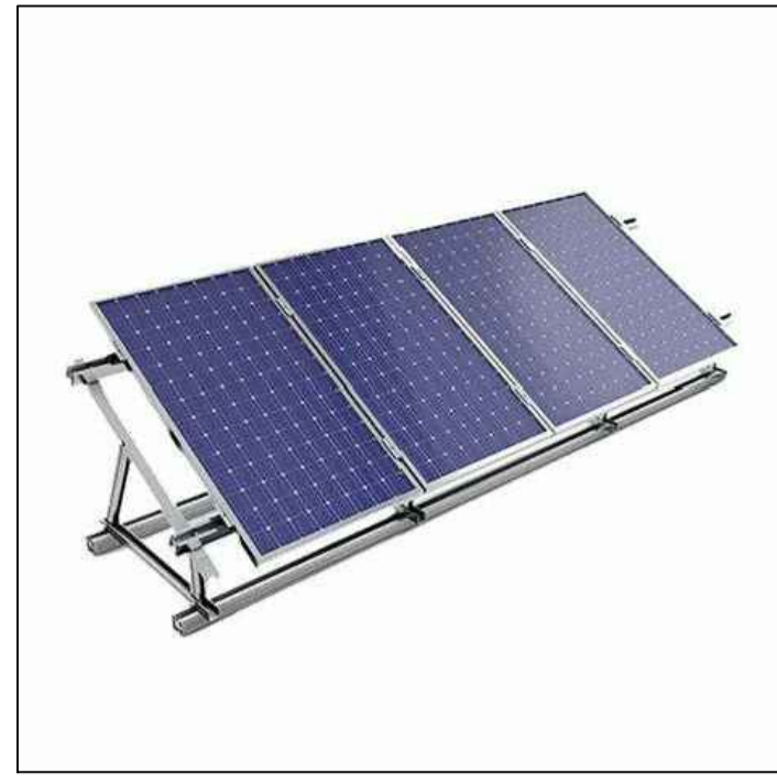
PROPOSED SOLAR FIELD MOUNTED UNITS