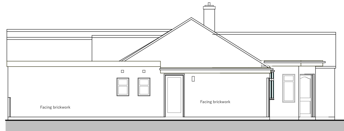
E04 - Existing Side Elevation (North) - 1: 100