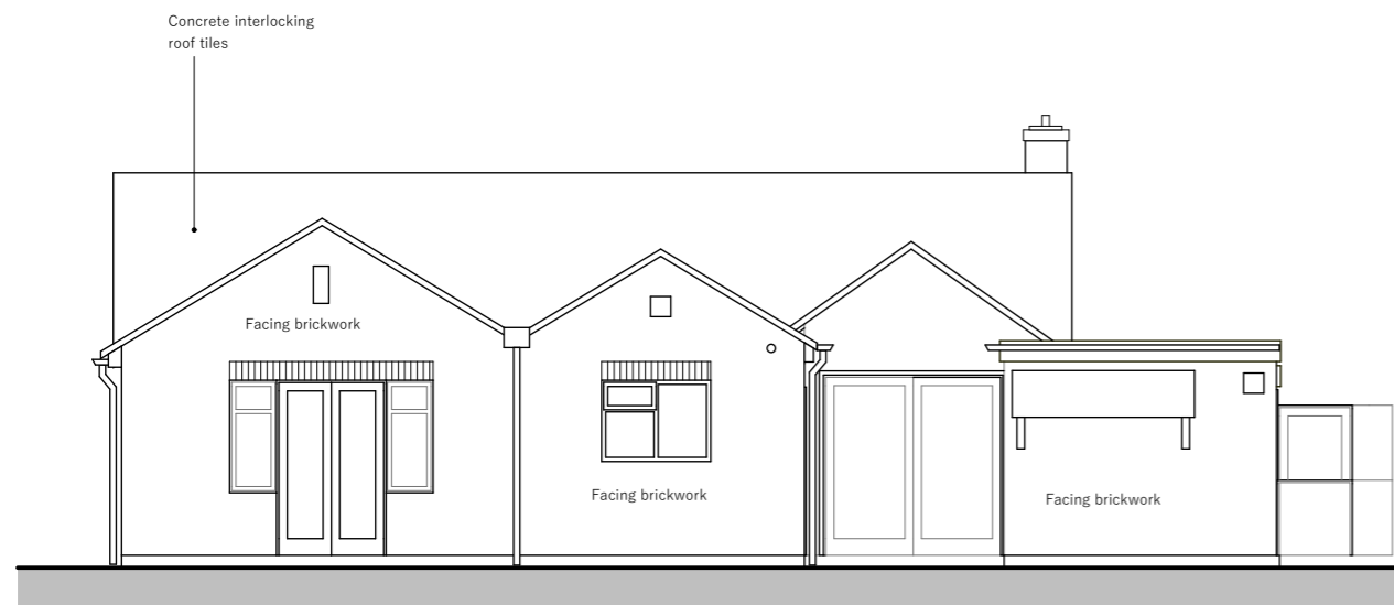
E03 - Existing Front Elevation - 1: 100