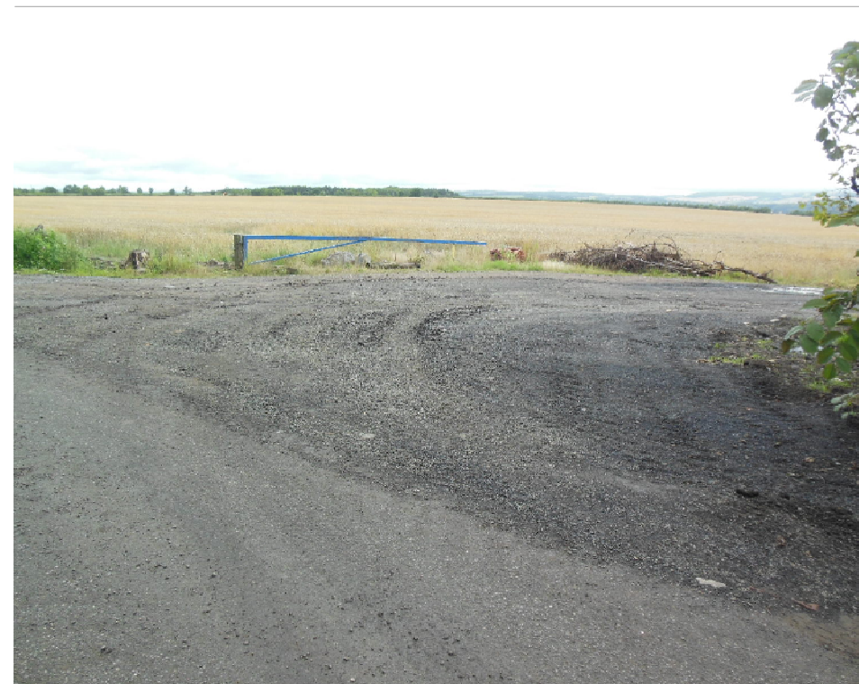
Image 1 - Existing Entrance