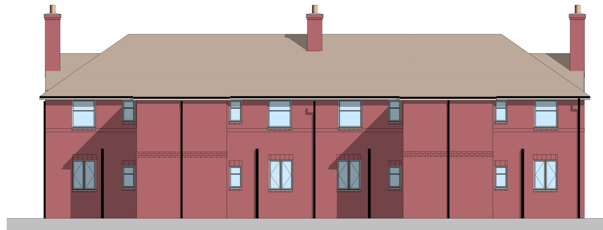
Rear Elevations Existing 1 : 100