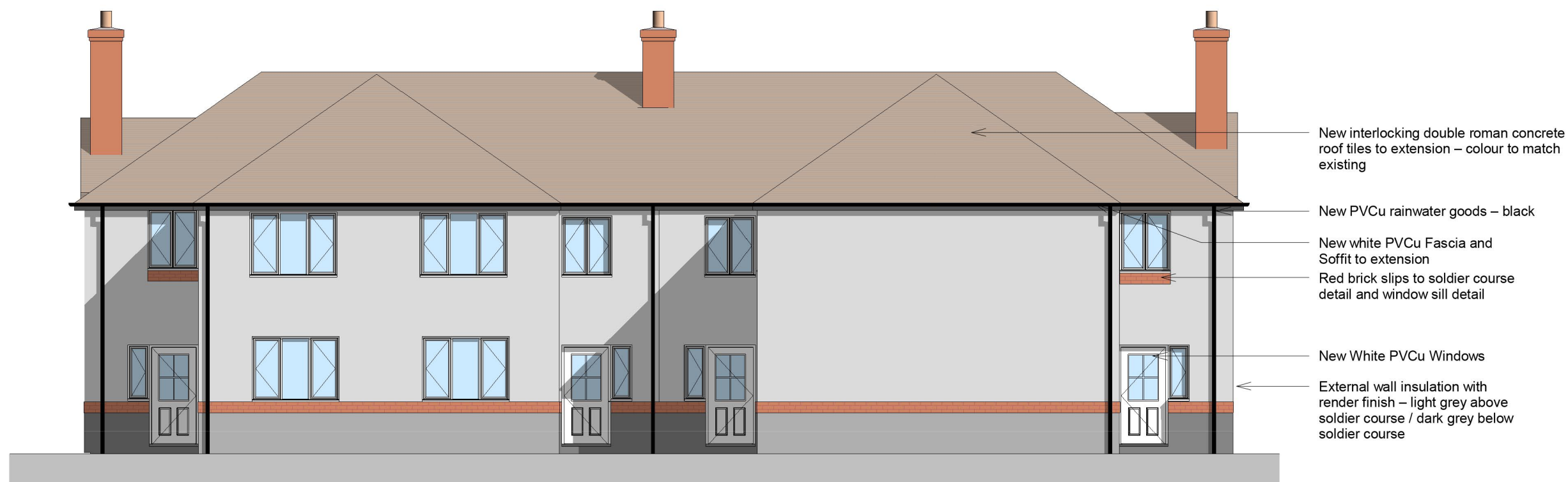
Rear Elevation Type 3 1 : 100