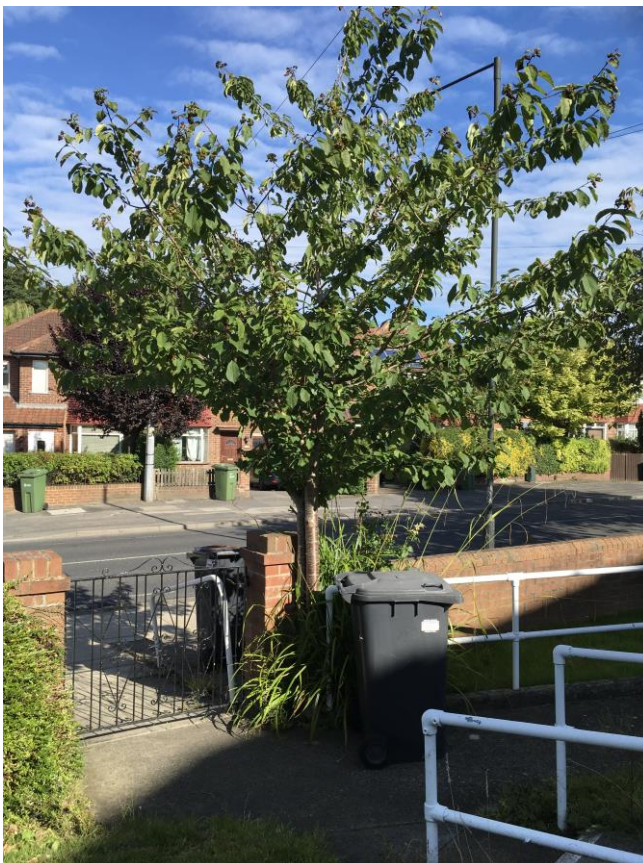
Photograph 4. T3