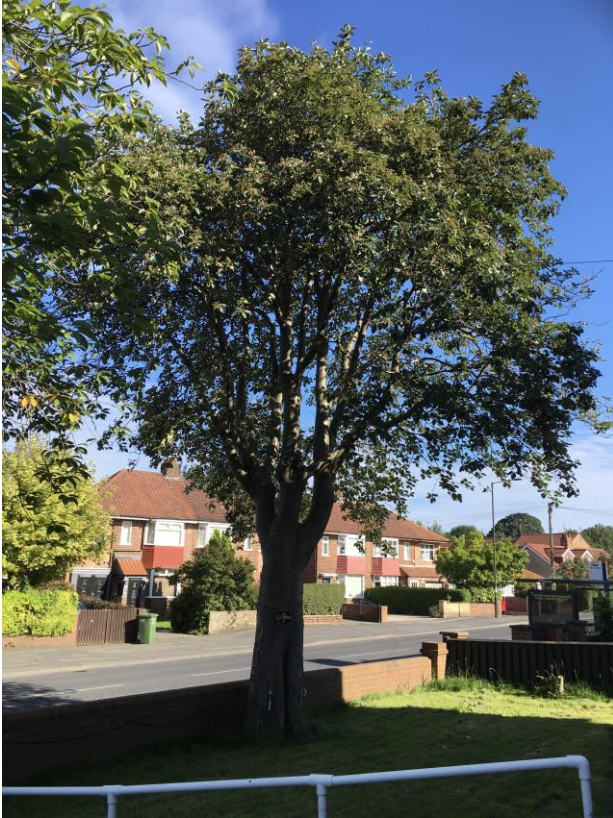
Photograph 1. T1