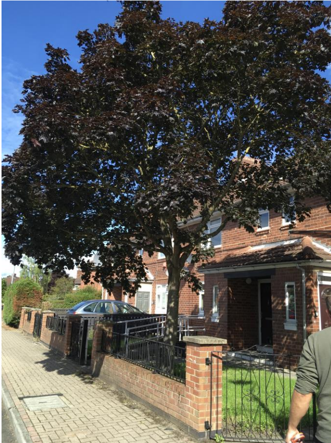
Photograph 15. T17