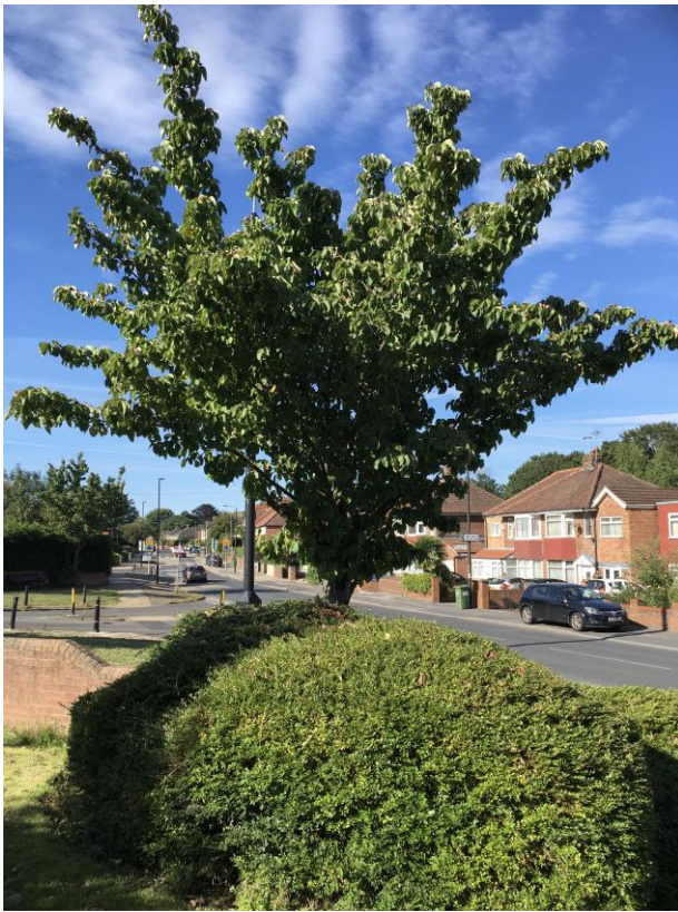
Photograph 5. T5