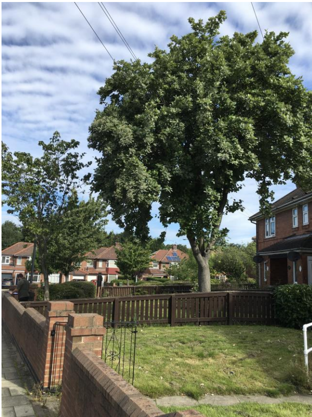
Photograph 7. T7 and T8