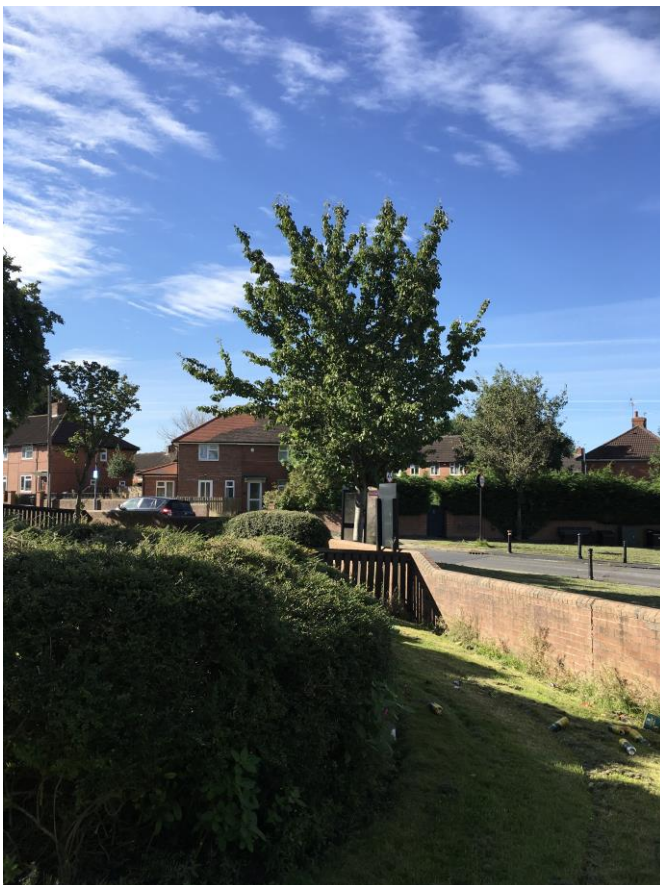
Photograph 6. T6