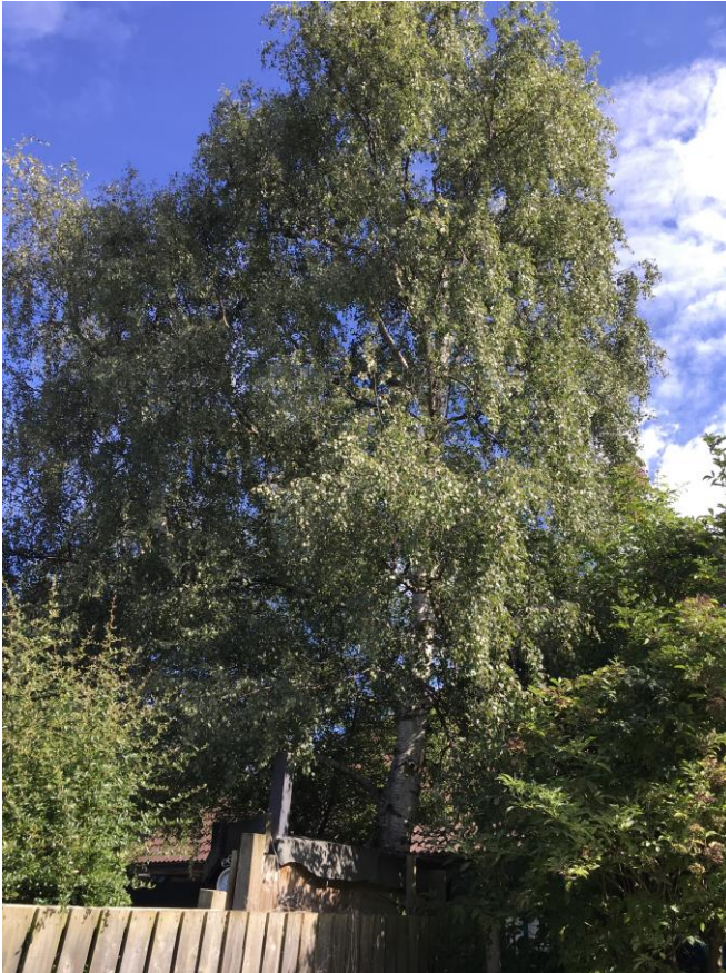
Photograph 13. T15