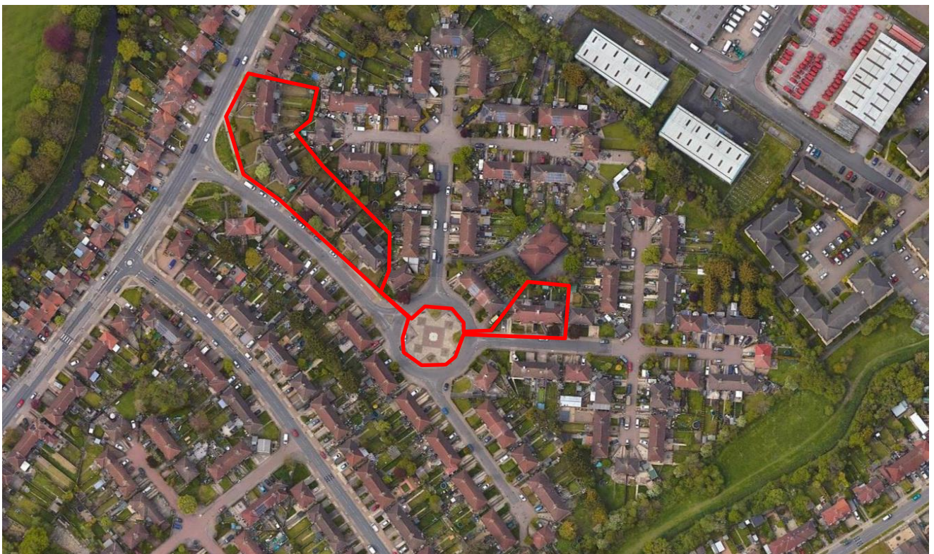
Figure 1. Site location and approximate site boundary (Aerial imagery dated 2022)