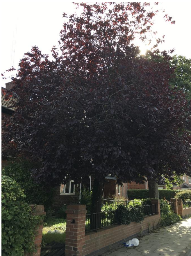
Photograph 9. T11