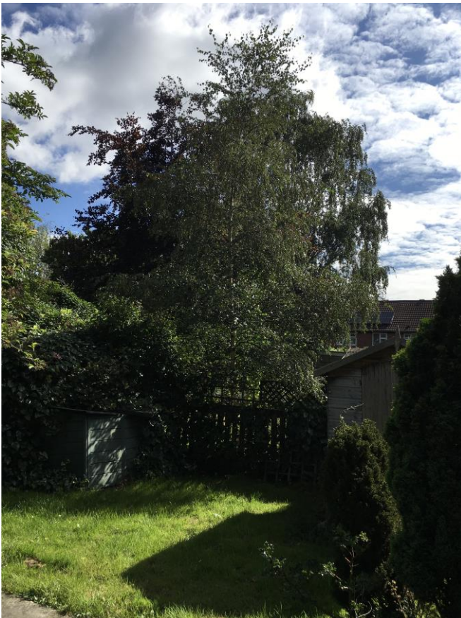
Photograph 14. T16