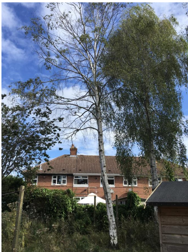
Photograph 10. T21