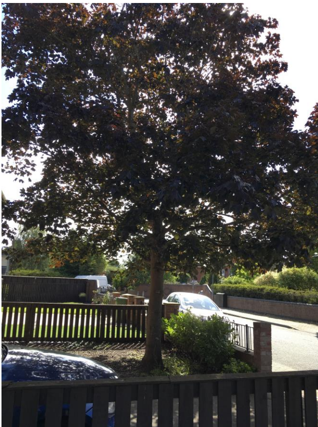
Photograph 16. T18