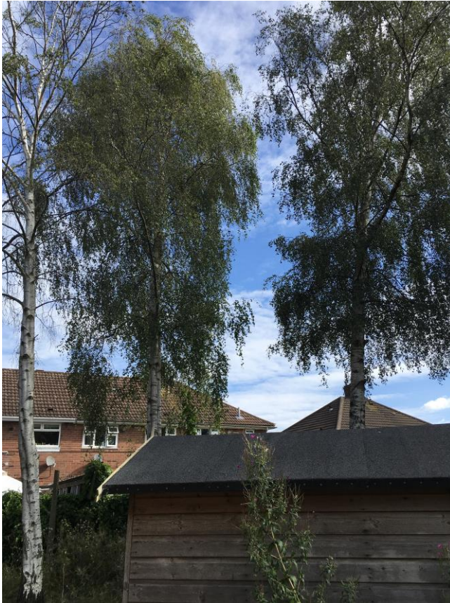
Photograph 11. G1