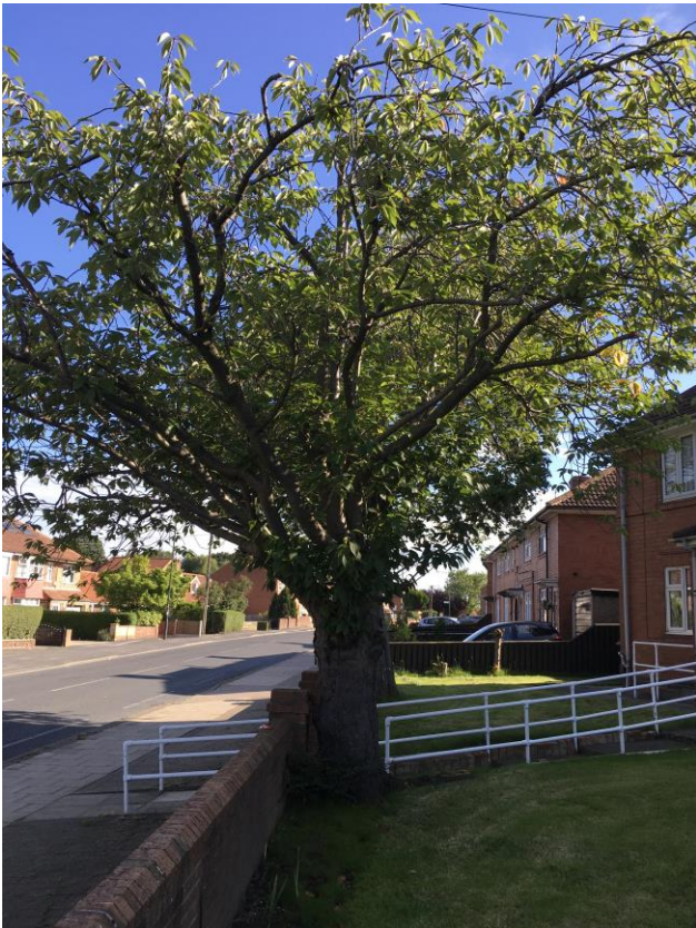
Photograph 2. T2