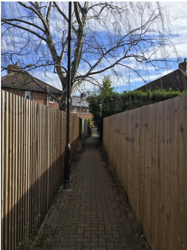
Photograph 8. Ginnel which runs underneath T10