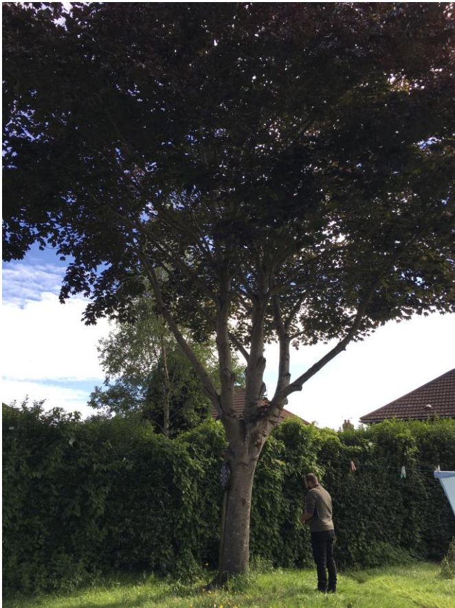
Photograph 12. T14