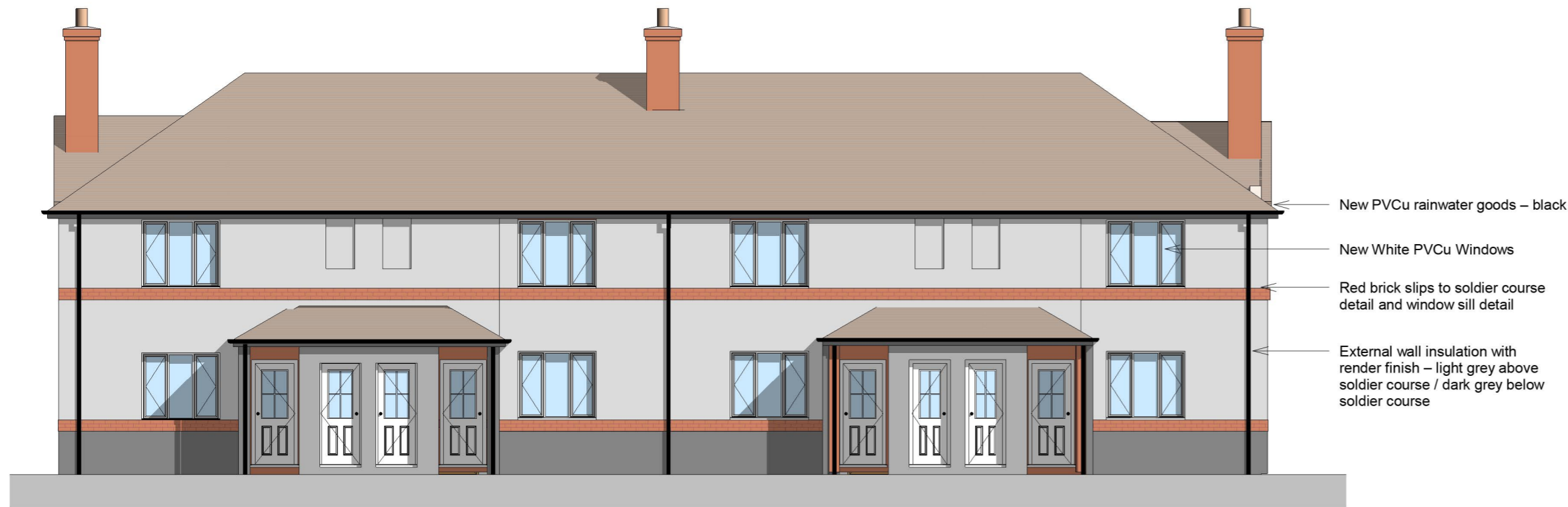
Front Elevation Type 2 1 : 100