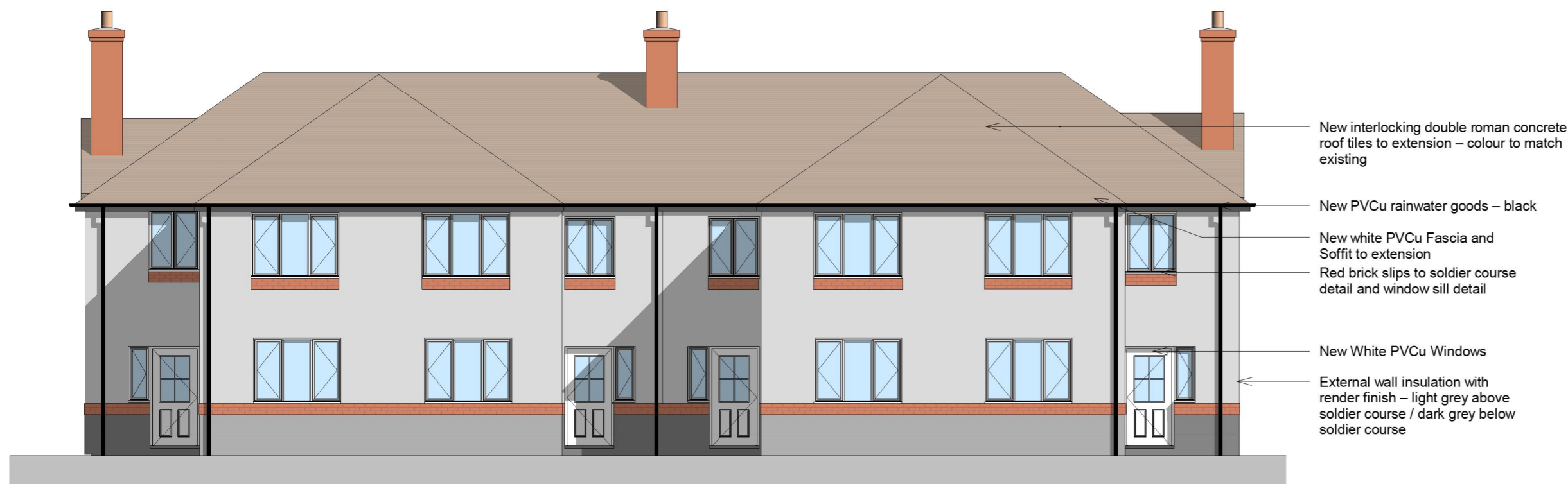
Rear Elevation Type 2 1 : 100