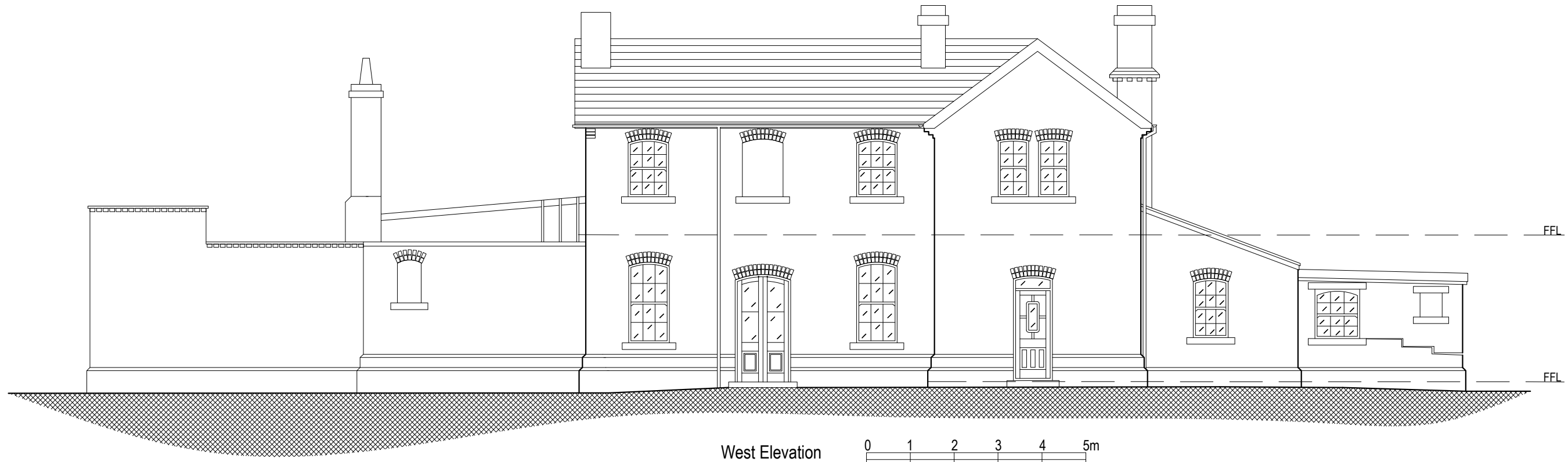
West Elevation 0 1 2 3 4 5m