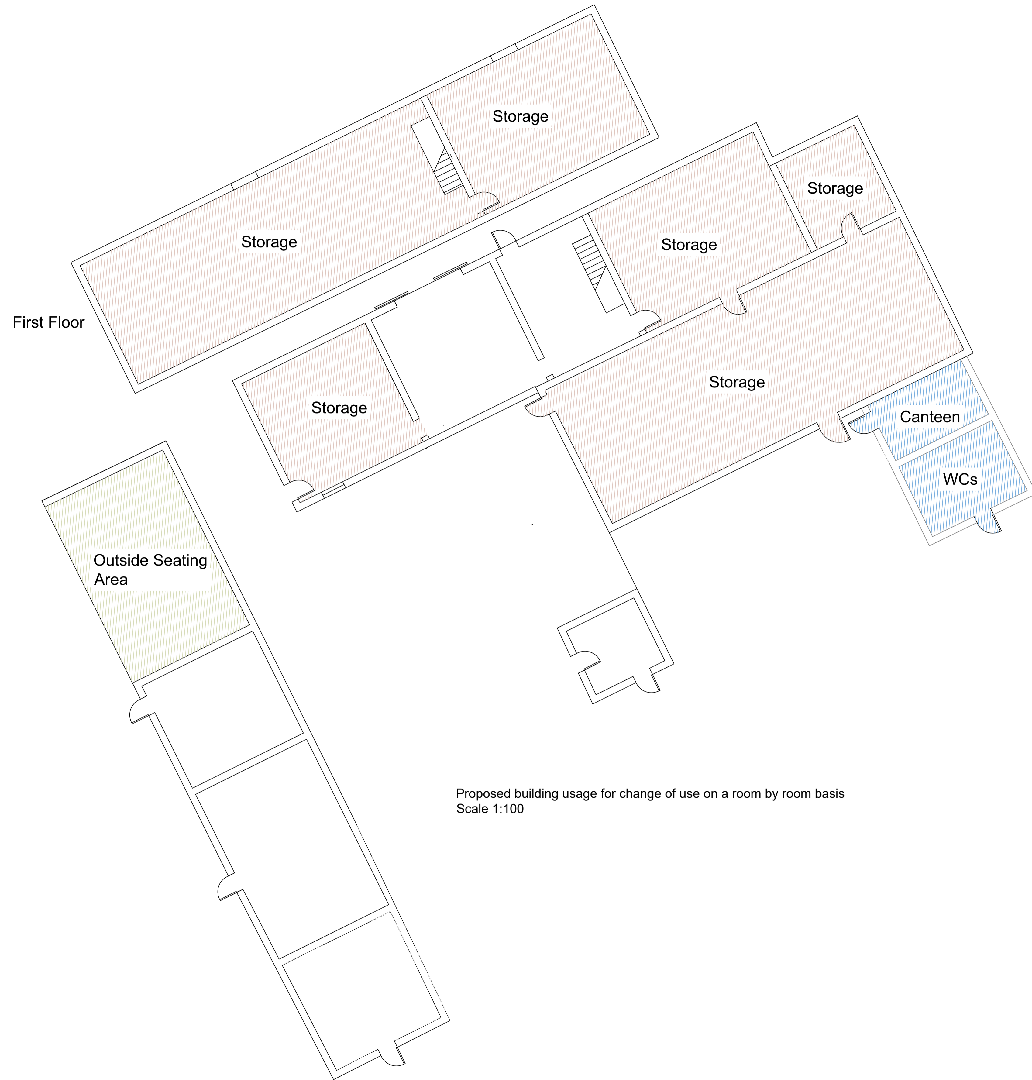
Proposed building usage for change of use on a room by room basis Scale 1:100