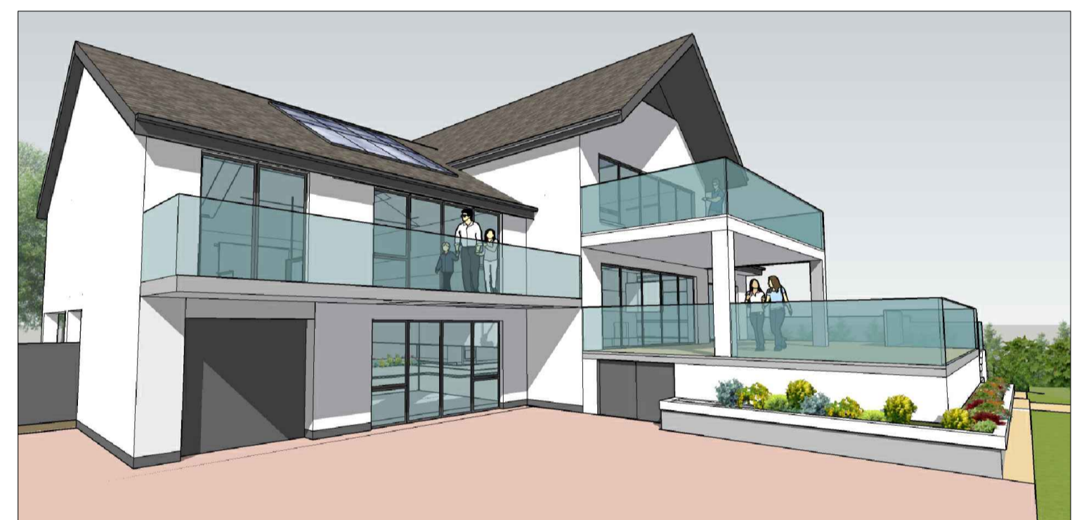
VIEW 3 FROM SOUTH-WEST