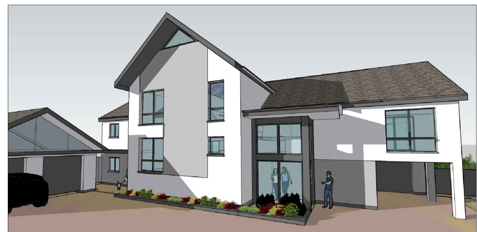
VIEW 2 FROM NORTH-WEST