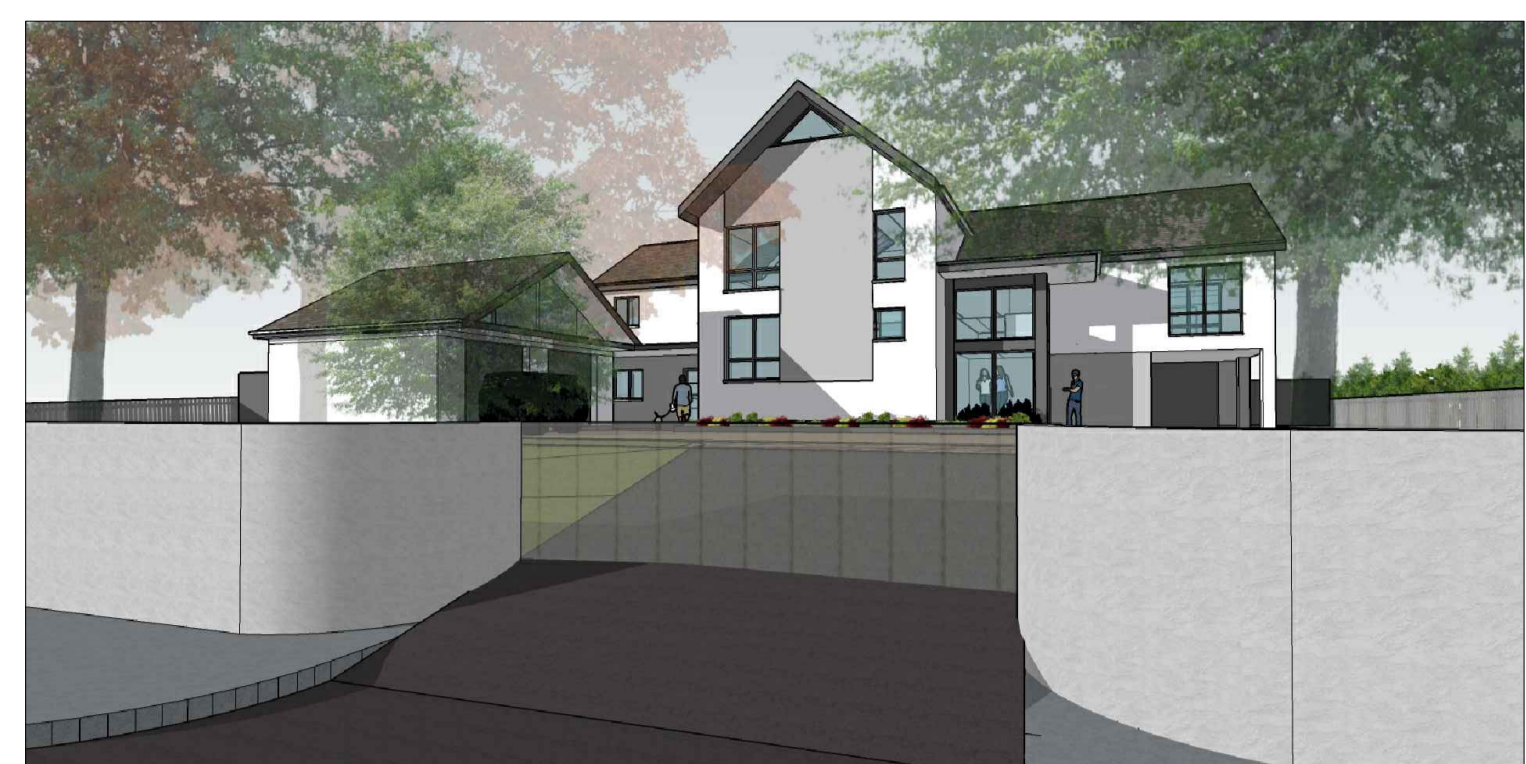
VIEW 1 FROM NORTH ON SUMMERLEA ROAD