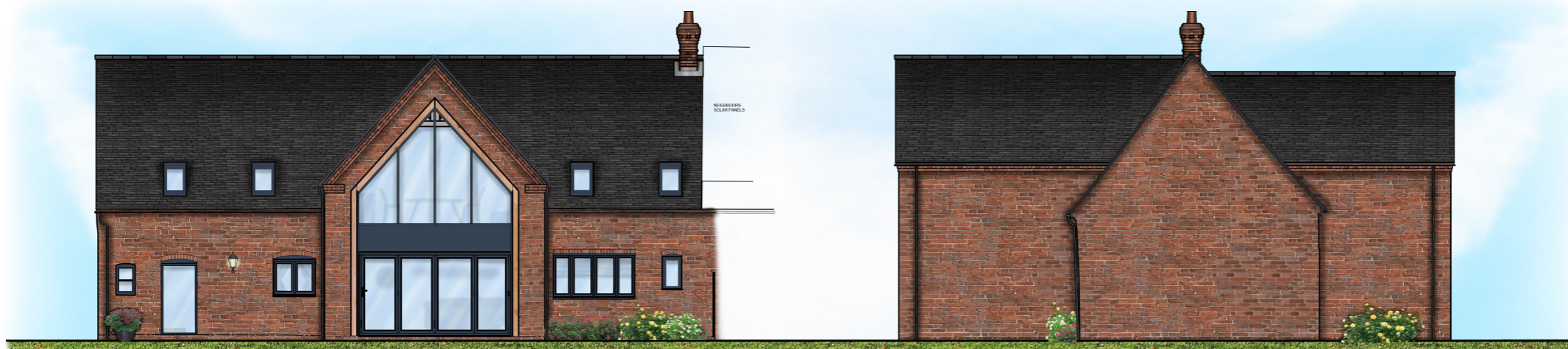
Artists Impression of Rear Elevation