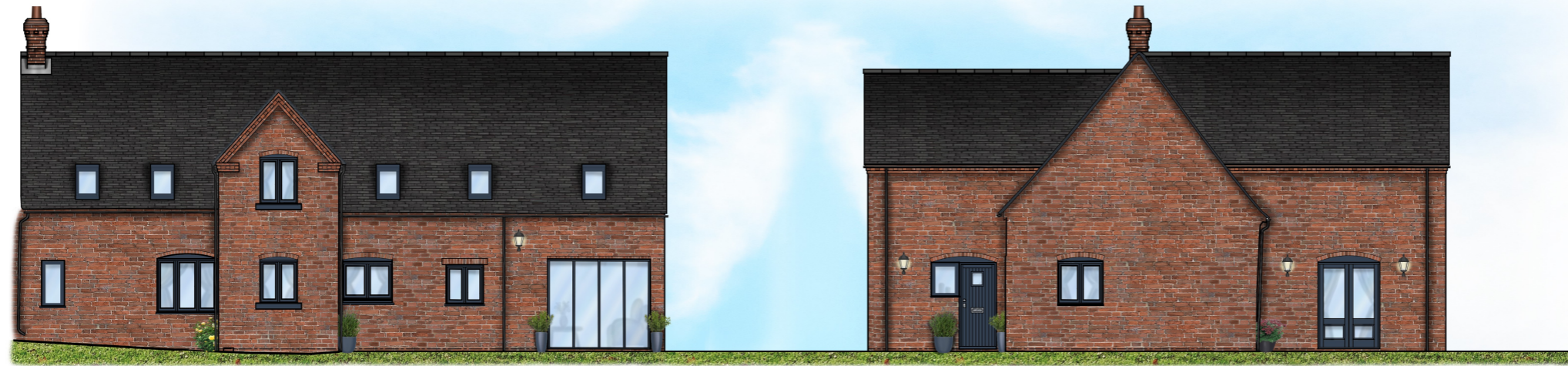
Artists Impression of Front Elevation