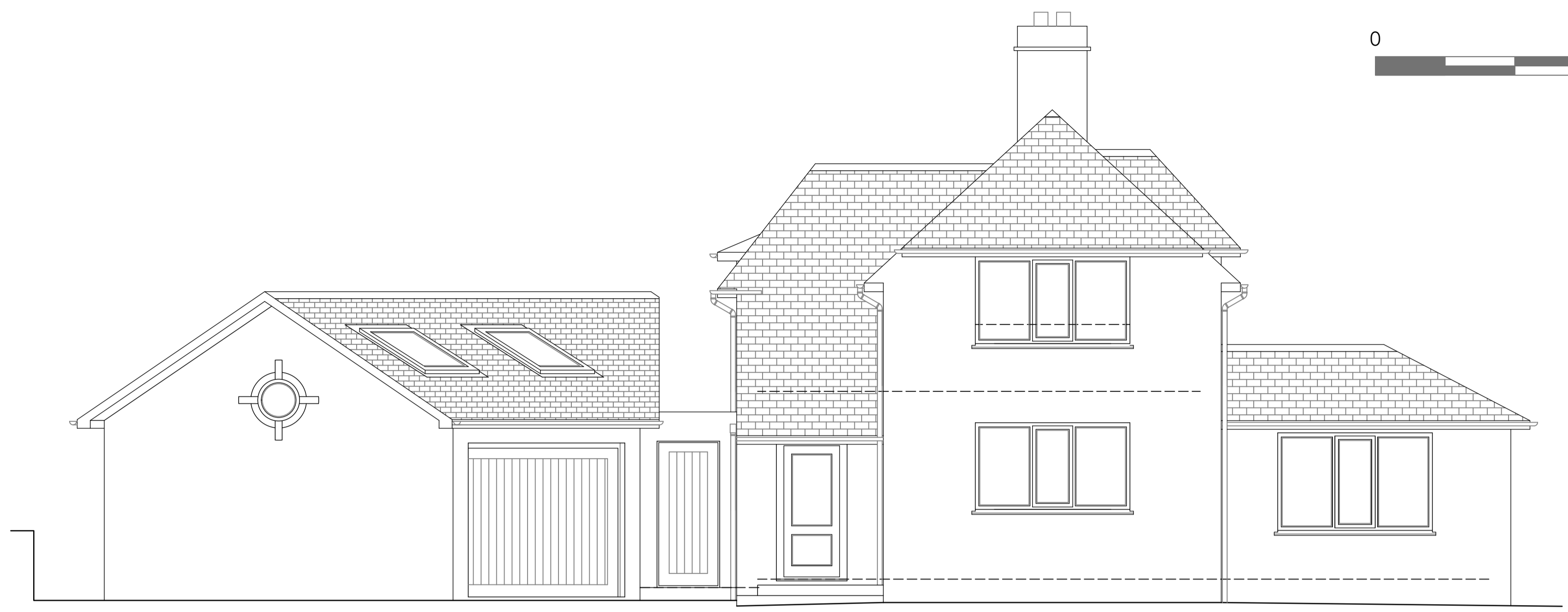
1 North Elevation as Proposed Scale 1: 50 @ A1