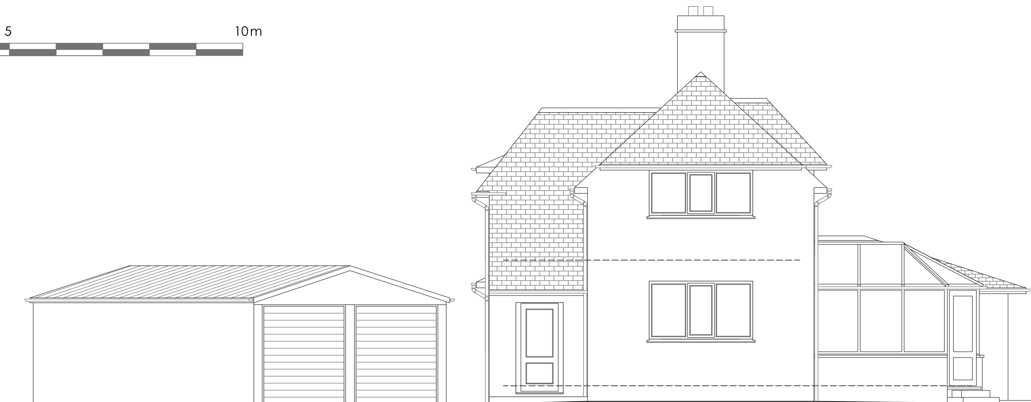
1 North Elevation as Existing Scale 1: 50 @ A1