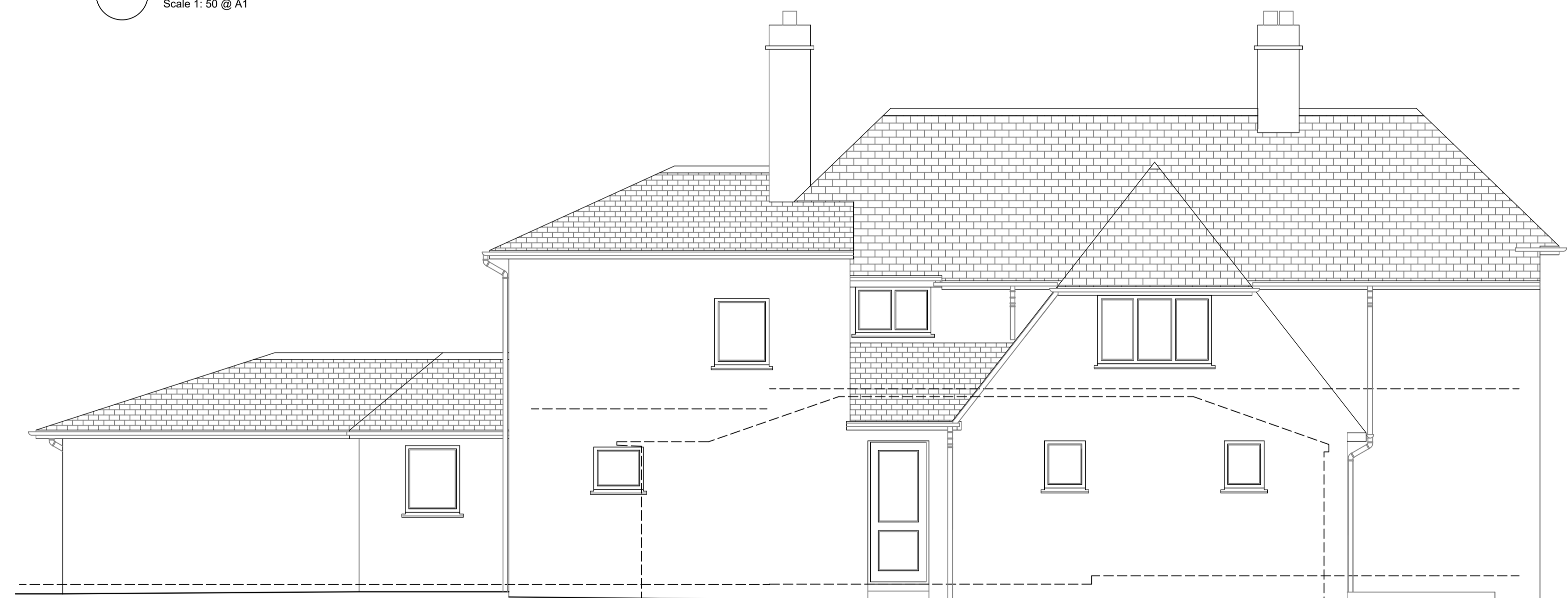
2 East Elevation as Existing Scale 1: 50 @ A1