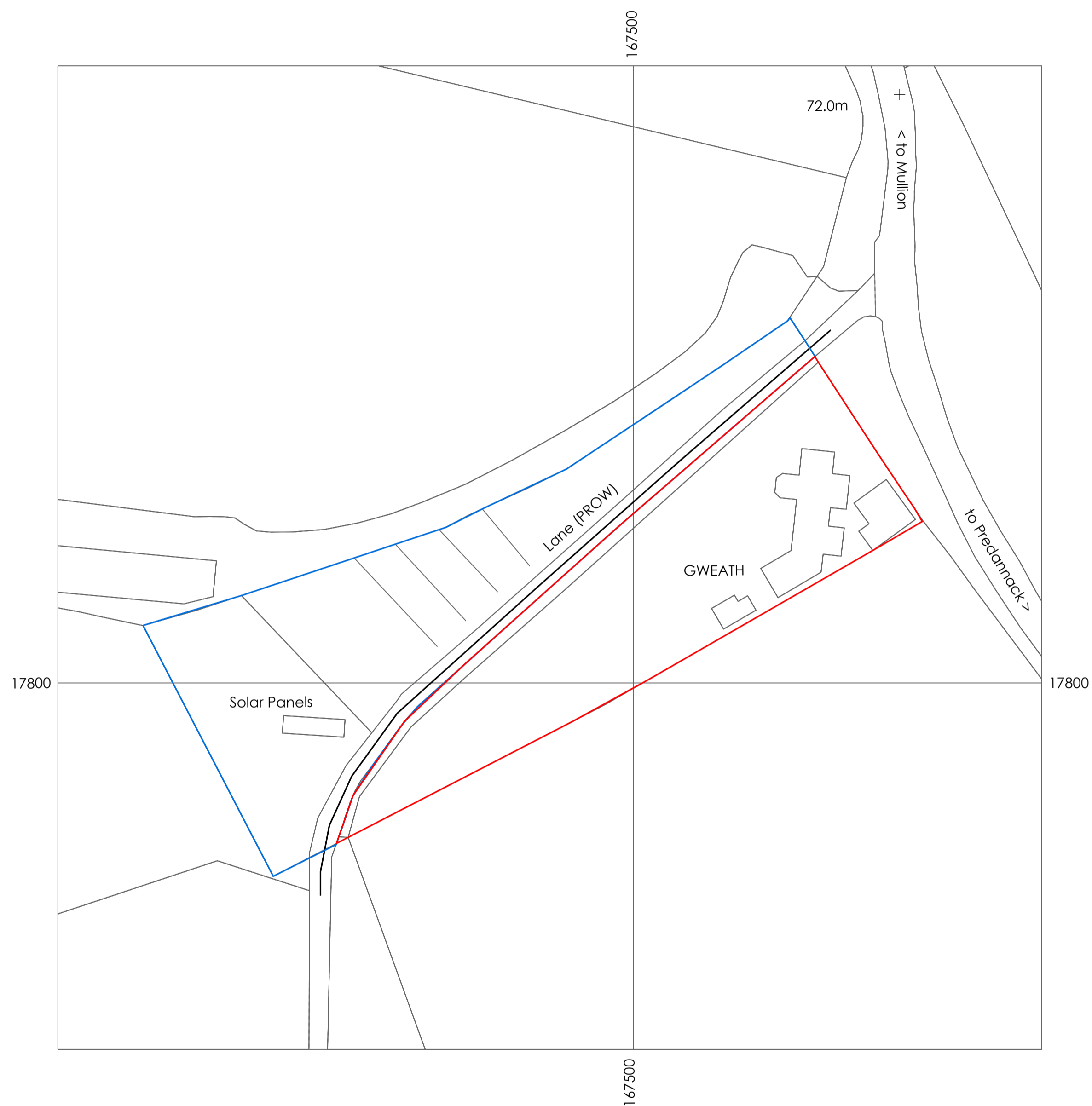
2 Block Plan Scale 1: 500 @ A1