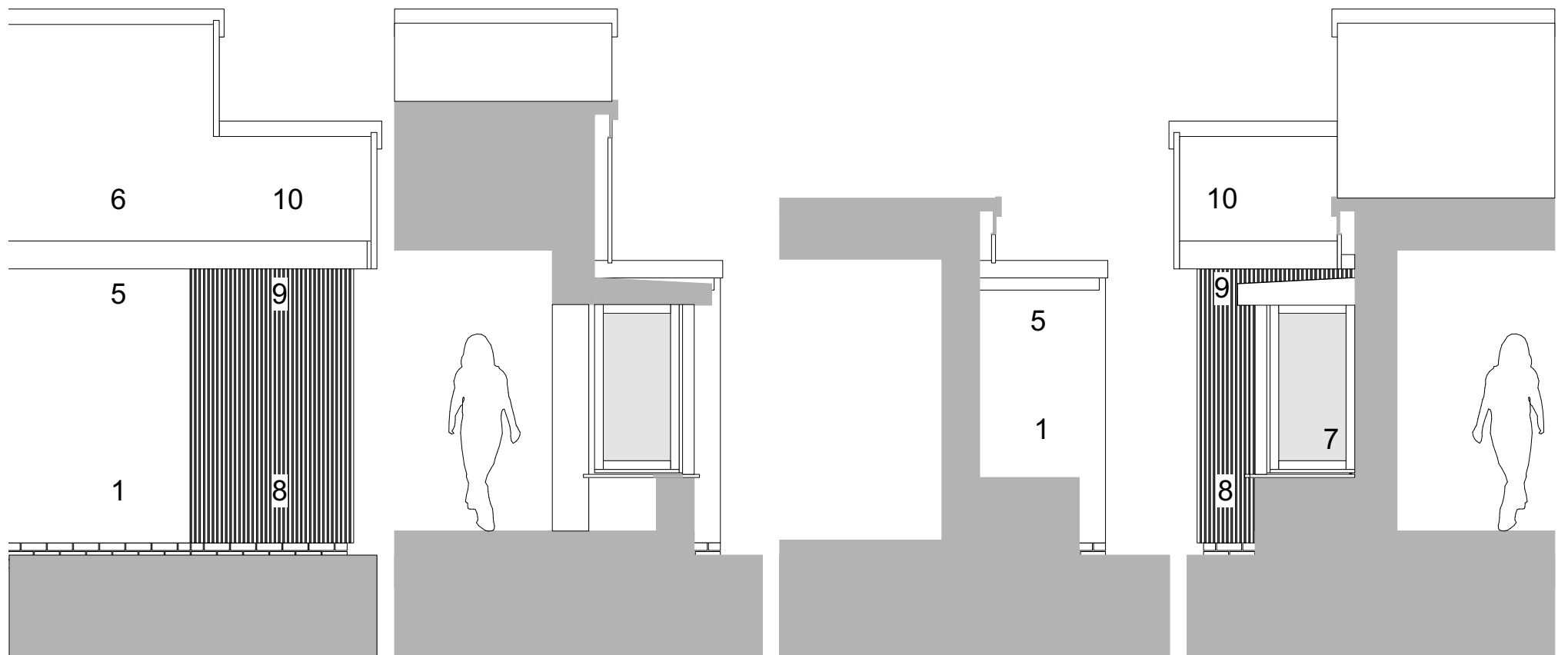
3 Elevation A